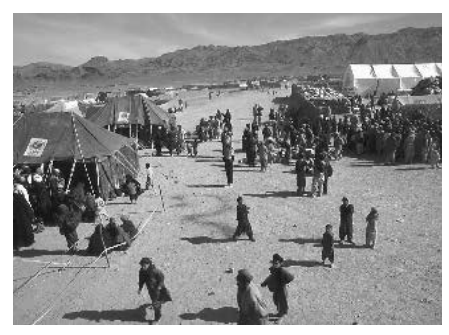
Pakistan: Having fled the violence in their country, Afghan refugees are seen here at a camp in neighbouring Pakistan.

At the end of the year, all the old assumptions were jettisoned. The apparent collapse of the Taliban and the signing of the Bonn Agreement establishing the Interim Administration brought a new spirit of optimism, and generous international offers of help to set Afghanistan back on its feet.