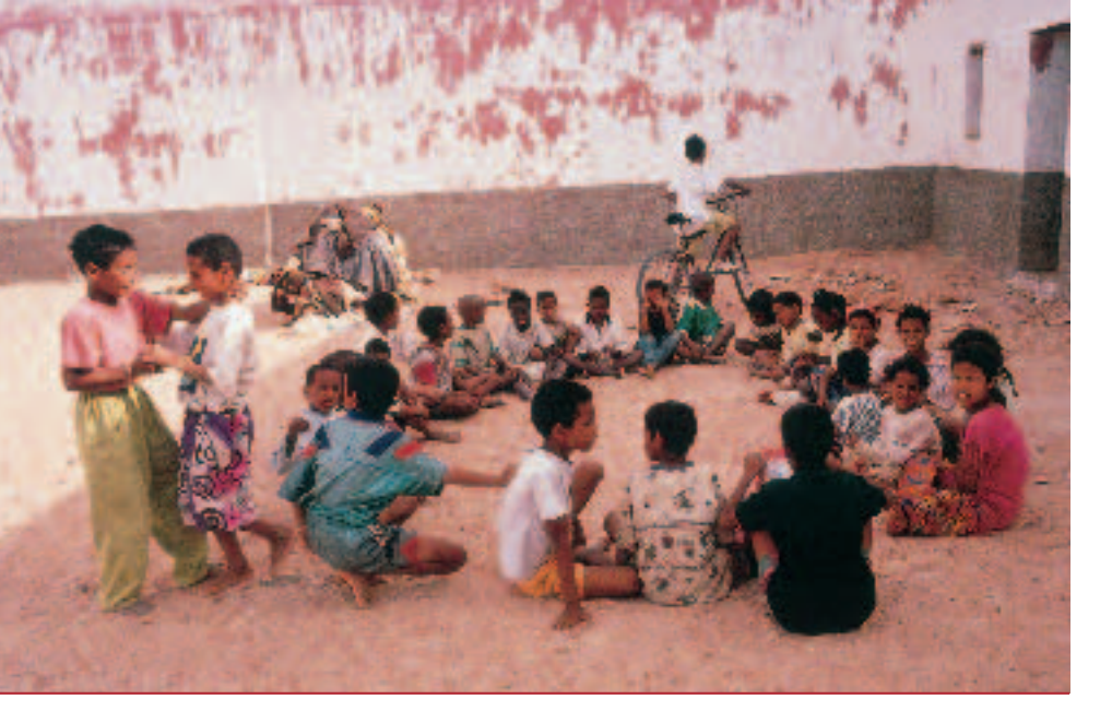
Algeria: Saharan refugees in Laayoune camp, Tindouf region.

will be achieved. Meanwhile, in Mauritania, some progress has already been made: draft national legislation has been prepared and is currently under review by the authorities.