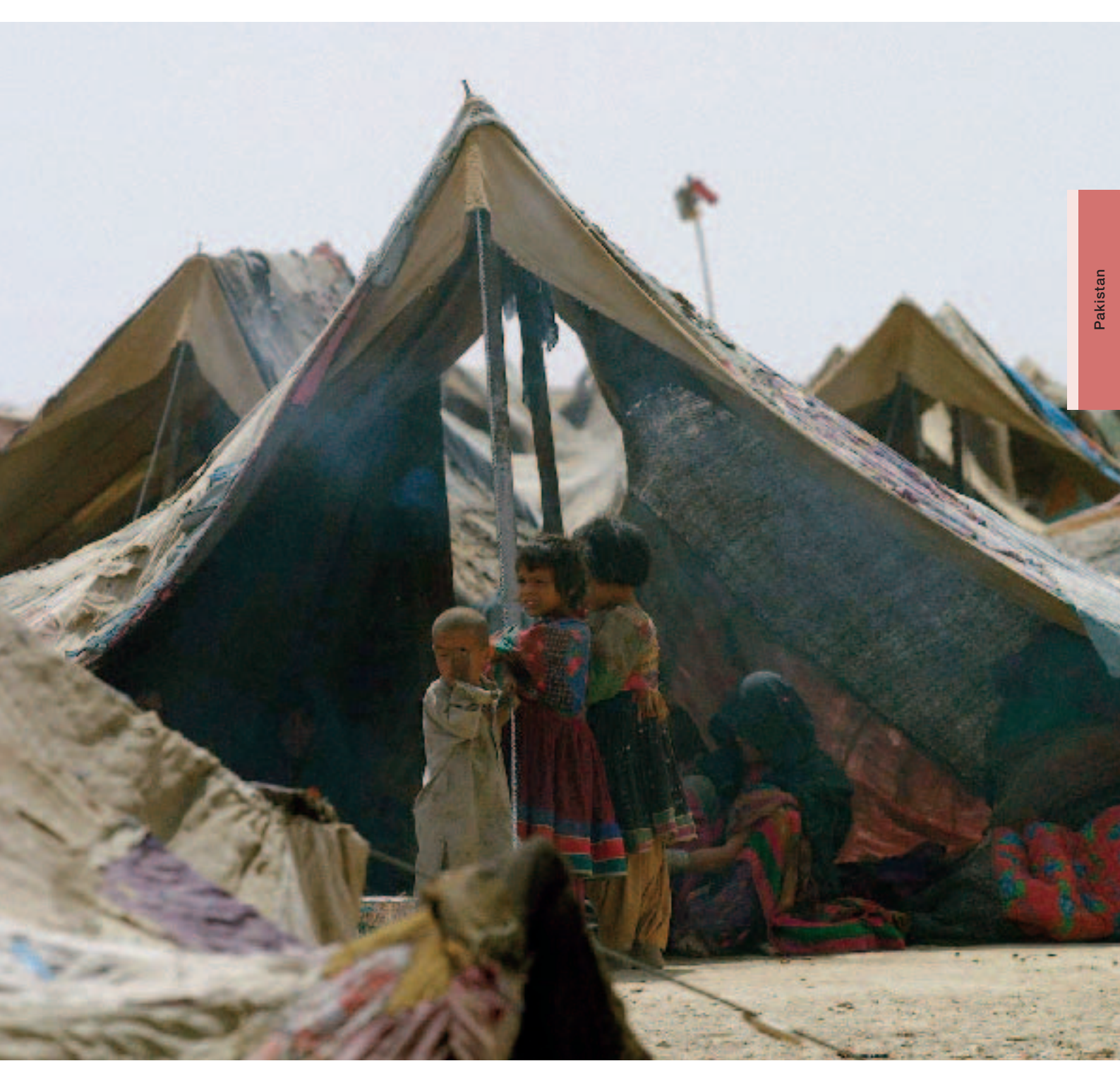
Pakistan: Afghan refugees in the Chaman waiting area.

make it difficult and more costly for aid agencies to assist refugees, but have created tensions between refugees and local communities in places like Chaman. Frustrations felt by landowners in this part of Pakistan culminated, in early 2003, in a strike that prevented UNHCR and its partners from accessing the camps. Although the dispute has since been resolved, efforts are underway to shift residents away from the border to a safer location with a better supply of water.