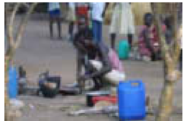
Bonga camp, Ethiopia.

Office supplies, the payment of per diems, bank charges, communication and utility costs in connection with the relocation exercise will be provided to implementing partners.