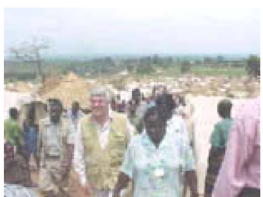
HC and the team coming out of the Transit Center.

After the initial phase, activities such as promoting the recognition by the local government (district councils) of the refugee presence, and sharing of ideas on their further integration, into the district county systems and activities leading to self-sufficiency will be implemented.