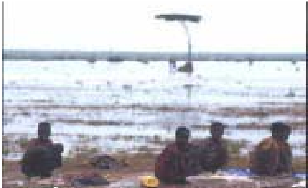
Somali refugees, floods, Dadaab camp, Kenya.

Construction of 840 pit latrines, four communal latrines and storage for required. Similarly. firewood is the plastic purchase of 5000 sheets. replacement of boreholes, construction of a food store and a distribution centre as well as a police outpost are needed to be put in place before the rains. Extension of the culvert box on the main high way to prevent future flooding of the staff compound and re-surfacing the air-strip are some other urgent requirements.