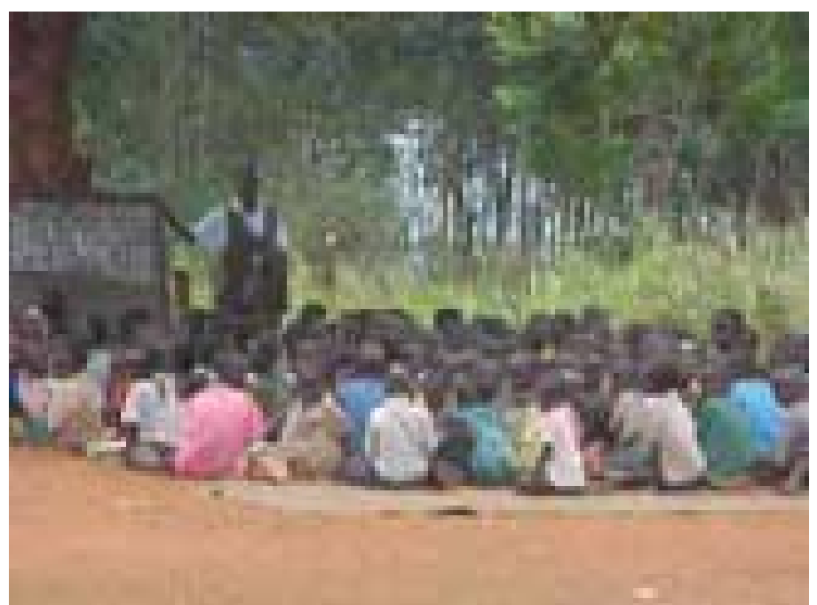
A class being conducted in the open air for primary students from the Acholi-pii group.

Offices and residences for implementing partners will be constructed and communications and data processing equipment as well as office supplies will be provided.