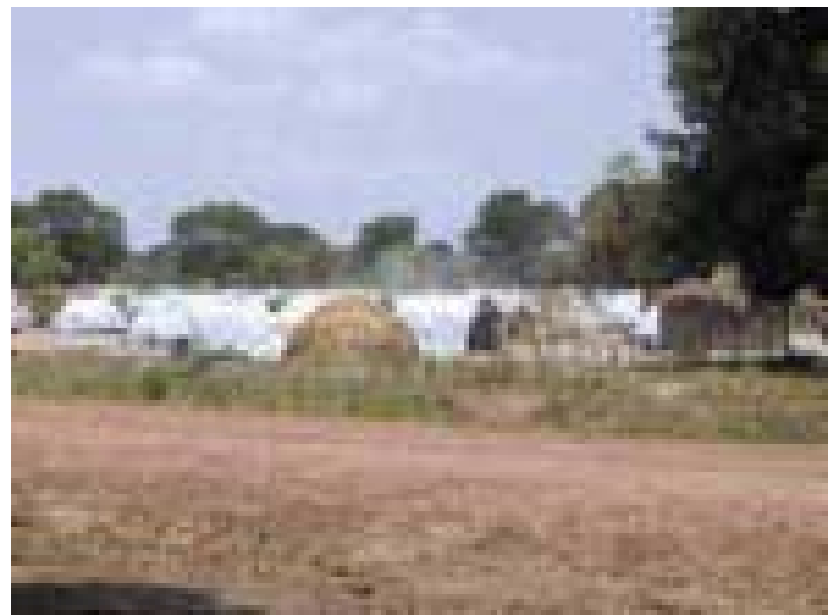
The temporary camp in Maro.

Finally, taking into account the remoteness of the location, they will serve as a backup during emergencies to UNHCR staff and its partners.