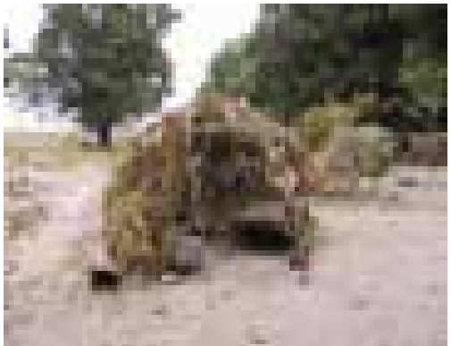
Rudimentary huts built by Central African refugees in Maro, Chad.