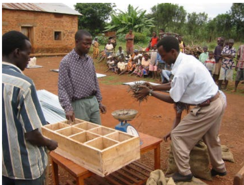
A returnee receives nails for constructing his individual house in Musinga province.

In Burundi, reception facilities will be provided for the returnees and reintegration activities will be expanded. It is planned that WFP will supply food to the returnees at least until the first harvest. UNHCR will ensure that refugees have access to potable water and it will provide materials for the construc-