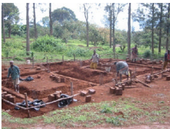
Returnees prepare the site of a new communal building in Ruyigi province

tion of family-based latrines. The Office, together with its partners, will support mobile health clinics in returnee areas and habitually conduct health screenings in the transit centres. Complementing UNICEF, UNHCR will also contribute to the development of a primary school system in return areas. The individual housing programme is the most important component for the reintegration of Burundian refugees as most of their houses are destroyed beyond repair after a decade of absence. UNHCR will provide the necessary materials for the construction of shelters, while the returnees will provide labour as well as easily available materials themselves. Community services will be provided and income-generation activities will be conducted. UNHCR will also support the preservation of the environment in Burundi. To ensure the sustainability of return, UNHCR will promote dialogue between the returnees and the receiving population.