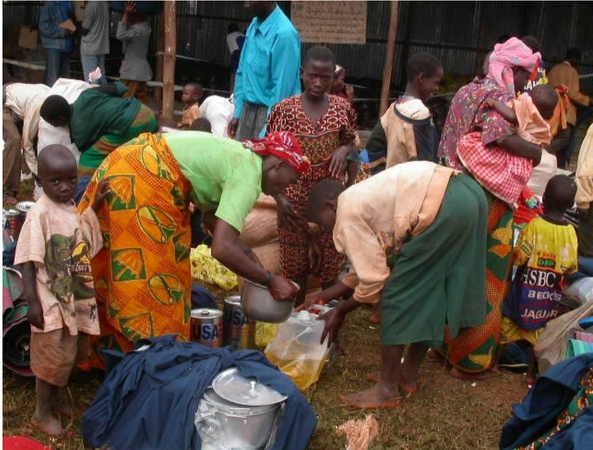
Returnees receive food rations upon their arrival in Gisuru transit centre, January 2004.

mission Nationale de Réhabilitation des Sinistrés (CNRS). This will be complemented with cross-sector coordination meetings, which will set the objectives and technical standards of the sector and ensure a clear division of responsibilities between actors. UNHCR is actively collaborating with the UN Country Team in the Consolidated Appeals Process and its 2004 programme is included in the 2004 UN Consolidated Inter-Agency Appeal for Burundi , as will be the 2005 programme.