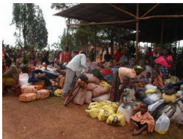
Returnees prepare to board UNHCR repatriation trucks in Gisuru transit centre for their final journey home, January 2004.

The Contact Group run by OCHA will coordinate the exchange of information on the activities of humanitarian/developmental agencies. Consistency in policy development will be monitored through the Steering Group of the Cellule Inter-Agence de Réinsertion (CIR), a UN body set up by UNHCR, UNDP and the World Bank to facilitate policy development and coordination in the context of the 4Rs (Repatriation, Reintegration, Rehabilitation and Reconstruction) initiative. Furthermore, UNHCR will work closely with the Ministère de la Réinsertion et de la Réinstallation des Déplacés et des Rapatriés and will render support to its tasks in the context of return and reintegration. It will also support the Com-