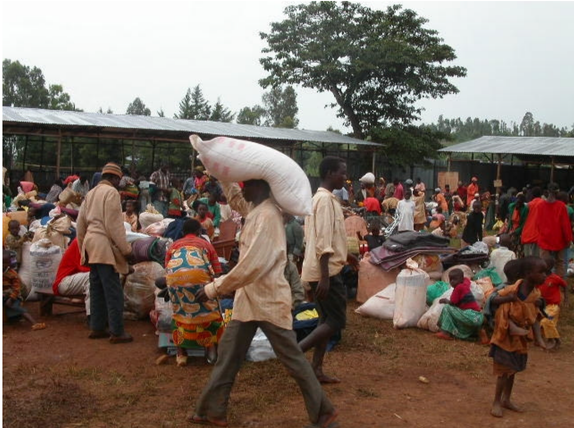
Returnees prepare for their transfer from Gisuru transit centre in Ruyigi to their communes of origin, January 2004.

ther difficulties arise from the fact that the FNL is still outside the current peace arrangements. Nevertheless, in spite of the ongoing impasse between the Transitional Government and the rebels, over 54,000 refugees have returned to Burundi since the beginning of the year: 50,000 of the returns were facilitated and some 4,000 refugees returned spontaneously.