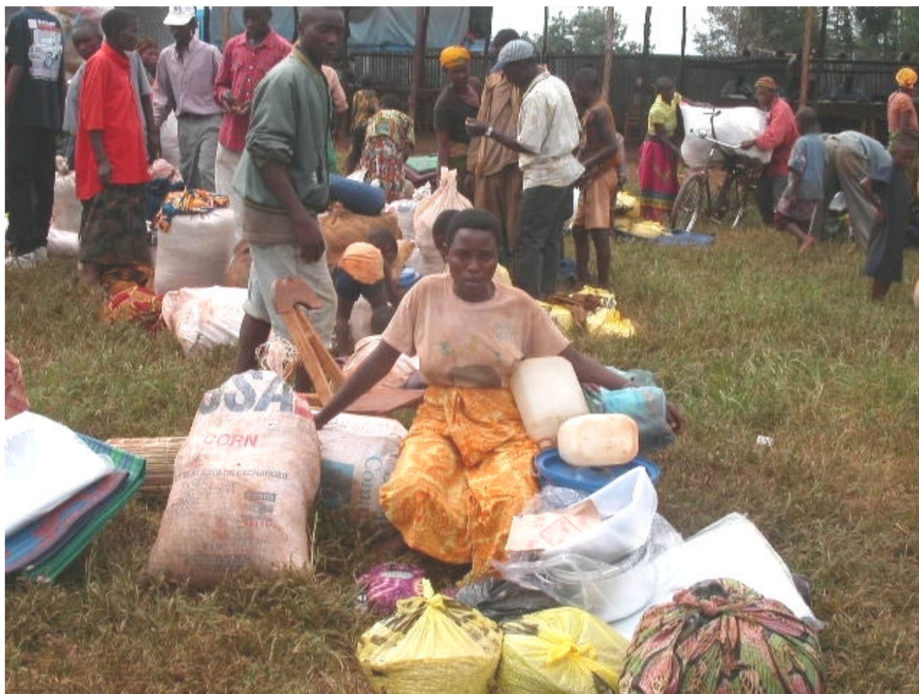
The first group of returnees in Gisuru Transit Centre in Ruyigi waiting to be registered, January 2004.