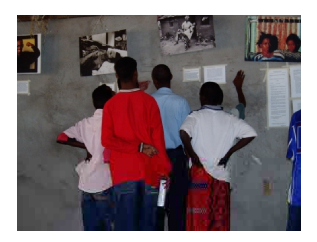
Positive Lives Exhibition in Dadaab refugee camp, Kenya

The Positive Lives Exhibition features photographs of people living with HIV. It aims to illuminate the positive human response to HIV and AIDS and provides a resource for HIV education, awareness and care. The exhibition was held in Kakuma and Dadaab refugee camps in Kenya. Based on the experiences in Dadaab, a comprehensive tool is being developed to capitalise on the momentum gained during the exhibition and enhance further discussion on HIV and AIDS related issues in the refugee setting. In Somalia, 20 pictures from the exhibition were used to support and facilitate the discussion on HIV and AIDS during training courses in Puntland and Somaliland.