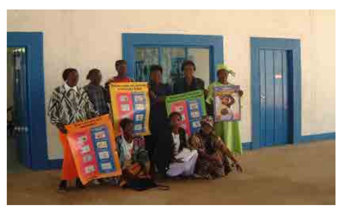
Women's group In Osiri, Namibia, with HIV awareness materials

The HIV/AIDS programme in Namibia continued to focus on building skills and awareness among Angolan refugees prior to their return. As Angolan refugees in Namibia originate from many different parts of Angola, which have varying levels of health and social infrastructure, it was critical to educate and equip returnees with knowledge about HIV and AIDS so they could contribute to the fight against the pandemic once back in their home communities. Activities in Osire refugee camp in Namibia were implemented by Africa Humanitarian Action (AHA). Through the UNHCR programme, AHA provided refugees living with AIDS with nutritional support to assist with recovery from opportunistic infections, weight loss and other AIDS-related conditions. AHA also provided refresher training on basic HIV/AIDS information to refugee leaders, youth and women's groups in order to enable them to pass on accurate information as peer educators in their community. Issues around stigma and discrimination against people living with HIV/AIDS (PLWH/As) were also addressed through this training, and through bringing local Namibians living with HIV and AIDS to speak in the camp. New IEC materials were developed by the refugees themselves for use in the camp, in local languages and using culturally appropriate messaging. These materials also formed part of the information package distributed to all returnees prior to departure for Angola.