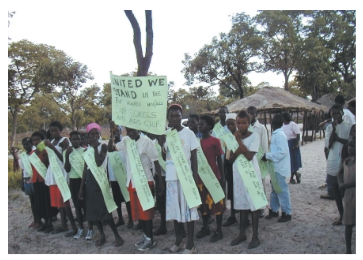
Anti AIDS school club, Nangweshi refugee camp, Zambia

Report on UNHCR's HIV and AIDS Programmes and Activities for 2004 04/AB/VAR/CM/267