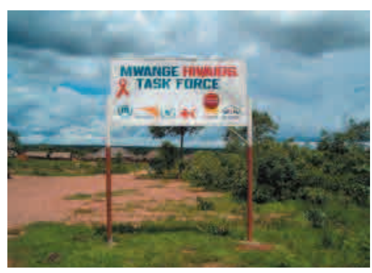
The HIV/AIDS Task force in Mwange, Zambia

The Refugee Life Skills Programme Manager from PPASA in South Africa was sponsored to attend an intensive course on "Programme Planning for Reproductive Health and HIV/AIDS in Southern Africa". The four week course, attended by Programme Managers from governments, NGOs and CBOs in the Southern African region, provided practical resources and tools for programme design, monitoring and evaluation. In addition, a staff member of an IP was supported to make a presentation at the 3<sup>rd</sup> Social Aspects of HIV/AIDS Research Alliance Resource (SAHARA) conference, attended by 350 delegates from 33 countries. The presentation was on the vulnerability of refugee women and children to HIV and AIDS, and the difficulties refugees experience accessing local HIV/AIDS programmes.