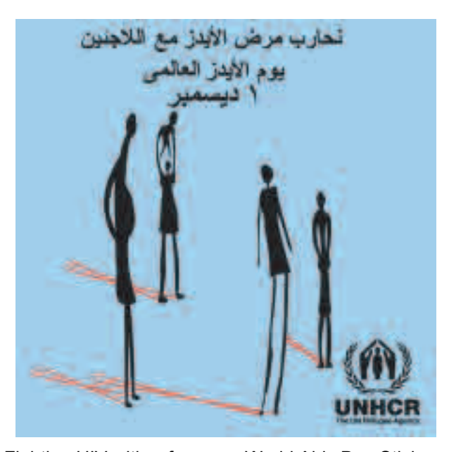
Fighting HIV with refugees - World Aids Day Sticker

In South Africa, a competition was organised for graphic design students to develop the logo for UNHCR for the 2005 World AIDS Day. The winning design was shared with UNHCR programmes worldwide. Stickers and T-shirts featuring the design were printed in many languages, including Arabic, English, French and Nepali. In the field, World AIDS Day was commemorated in conjunction with the 16 days of activism against violence. Many activities were organised for and by refugees in numerous countries. In Geneva, UNHCR joined UNAIDS and other cosponsors for a two hour commemoration around the theme: "women, girls, HIV and AIDS".