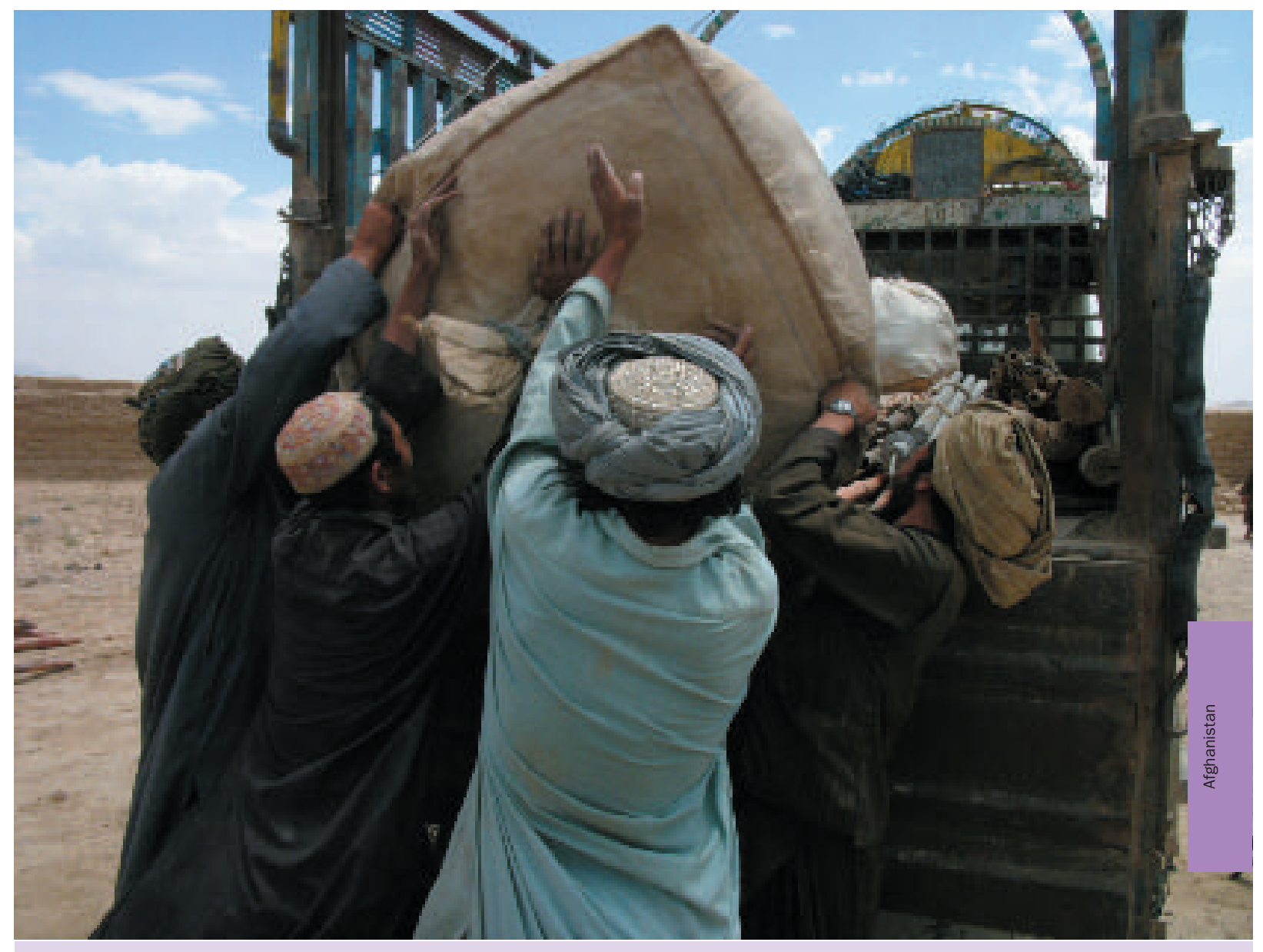
IDPs loading their belongings in a truck that will take them to their homes in the north of the country.

the Taliban. UN and international NGO premises, including UNHCR's, were systematically attacked and damaged. UNHCR's guesthouse was looted and set on fire. Crime is also on the increase with threats of kidnapping of international staff, especially in Kabul.