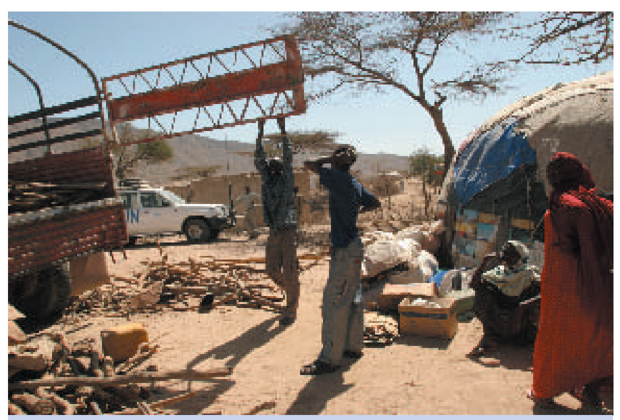
Somalia: Returnees from Ethiopia arrive at Harrirad village, "Somaliland". Harrirad had been almost entirely destroyed by the war, but now, reconstruction of villages and infrastructure is taking place at a rapid pace.

Countries hosting large refugee populations are frequently amongst the least developed in the world and refugees fleeing to these countries often find themselves living in remote, neglected areas where high levels of poverty prevail. In addition, although their lives may not be in immediate danger, refugees may face limitations on their freedom of movement, employment and, in some cases, education, stifling their capacity to become productive members of a society and, consequently, perpetuating poverty. For the host country, the presence of refugee populations for protracted periods has a long-term economic and social impact that, if not adequately addressed,