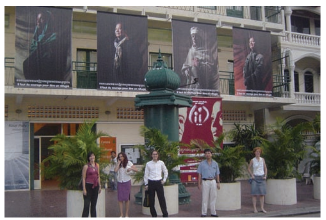
Courage banners decorated the entrance of the CCF where the film festival took place: ©UNHCR/M. Coghlan

The first ever Refugee Film Festival in Cambodia took place in Phnom Penh from 20 to 26 June. It was so successful that a follow-up was organized in another Cambodian city, Siem Reap, from 5 to 14 July, and some NGOs have asked UNHCR to borrow some of the films for further screening. The festival was made possible due to a very productive partnership between the French Cultural Centre (CCF) and UNHCR. The media campaign was very successful in raising awareness of the festival. 10,000 leaflets and flyers were distributed, announcements were put on websites and CFF's official magazine and an e-mail campaign was sent to embassies, media members and UN agencies.