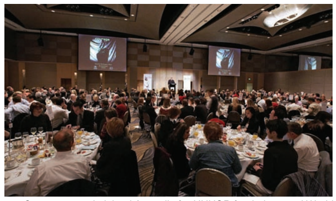
Over 400 people joined Australia for UNHCR for their annual World Refugee Day breakfast in Sydney

The Regional Office in Australia also covers New Zealand and Papua New Guinea.