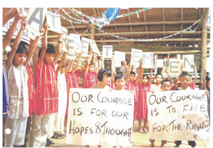
Tham Hin Camp: Children talking about courage and durable solutions:

WRD celebrations at all nine refugee camps on the Thai-Myanmar border included weaving and craft making exhibitions, cultural and traditional performances such as plays, song,