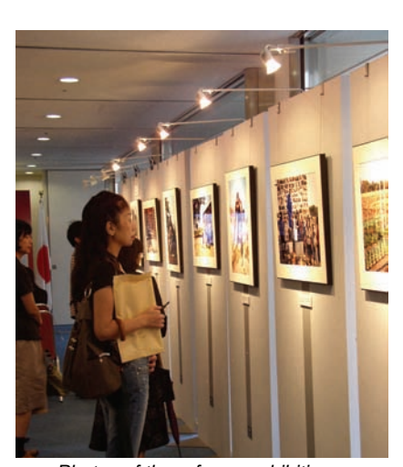
Photos of the refugee exhibition venue "Angolan Refugees and Local Zambians"

The international conference hall of the UN House hosted a WRD public symposium "Perspective of Japan's Acceptance and Assistance for Refugees" on 18 June. It was organized in cooperation with UN University, PARinAC Japan Forum and Japan for UNHCR and supported by Cabinet Secretariat, Ministry of Foreign Affairs (MOFA), Agency for Cultural Affairs, Ministry of Justice, Ministry of Health, Labour and Welfare, and the Yomiuri Shimbun newspaper. The symposium was attended by approximately 340 people and Mrs. Sadako Ogata's special video message was screened.