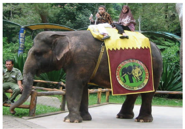
Refugees having a fun ride on the elephant

nation and collaboration of UNHCR and its implementing partners, Yayasan Pulih and PMI, with the local authorities. The session was attended by 33 participants.