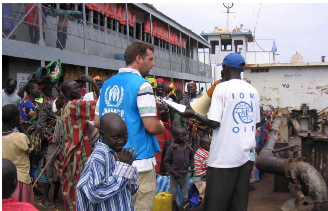
Bor Dinka IDP returnees arrive in Bor and are received by IOM and UNHCR staff.

There have been hardly any protection programmes provided for IDPs in Khartoum and recently even less as some of the NGOs which were providing assistance had to shift their attention to the crisis in Darfur and South Sudan. Severe restrictions by the Government to access camps (until recently), socio-economic marginalization of IDPs and persistent interference of security organs, including demolition of houses, forced relocation and arbitrary arrests of IDPs, has created a difficult environment and exposed IDPs to living conditions that fall short of international human rights standards. In this context, UNHCR will pursue protection activities designed to accompany and support their return to and reintegration in South Sudan.