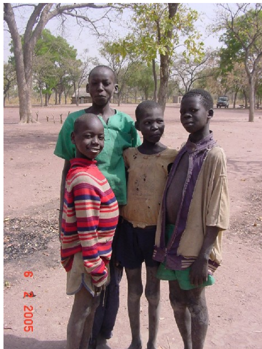
Sudanese children in Rumbek.

Security conditions are not ideal in the South, given the ethnic mosaic, historical tribal conflict and tenuous peace with the north. However, refugees are still determined to return. The Office will only repatriate refugees and assist returning IDPs where security allows. Changed circumstances following the conclusion of the CPA offer the best possible