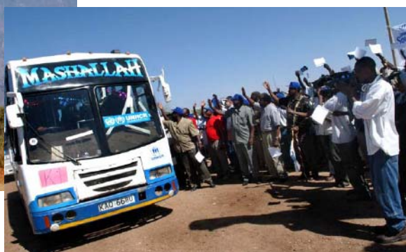
The first repatriation movement conducted by UNHCR brought refugees home from Kakuma refugee camp in Kenya on 17 December 2005.