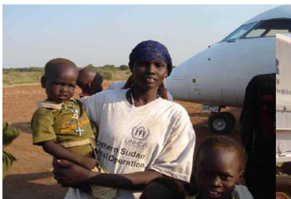
Returnees from Kakuma camp arrive in Bor.

UNHCR has also taken an active role in establishing the UN Protection Framework for Returns, which outlines the key protection principles and standards that will guide all UN agencies and partner organisations in the implementation of the UN Returns Policy Framework. UNHCR has also actively participated in the design and the revision of the UN Operational Plan for Spontaneous Returns .