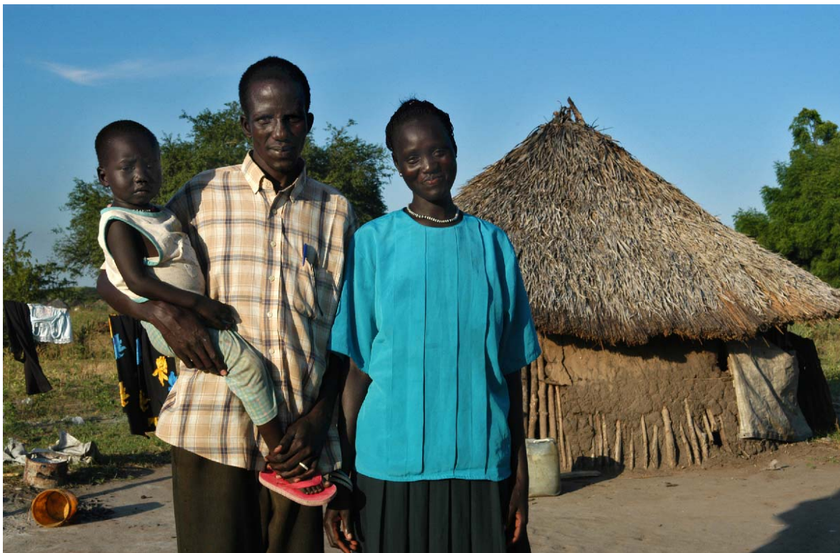
Refugee returnee family in Bor.

The return of refugees and IDPs to South Sudan is expected to gain momentum over time and take a few years to complete. While every effort will be made to facilitate and promote voluntary repatriation, the continued provision of protection as well as humanitarian assistance in countries of asylum will be required, though at progressively reduced levels. The phase-down will be matched by an increase in livelihood activities for returnees until development aid is made available in South Sudan.