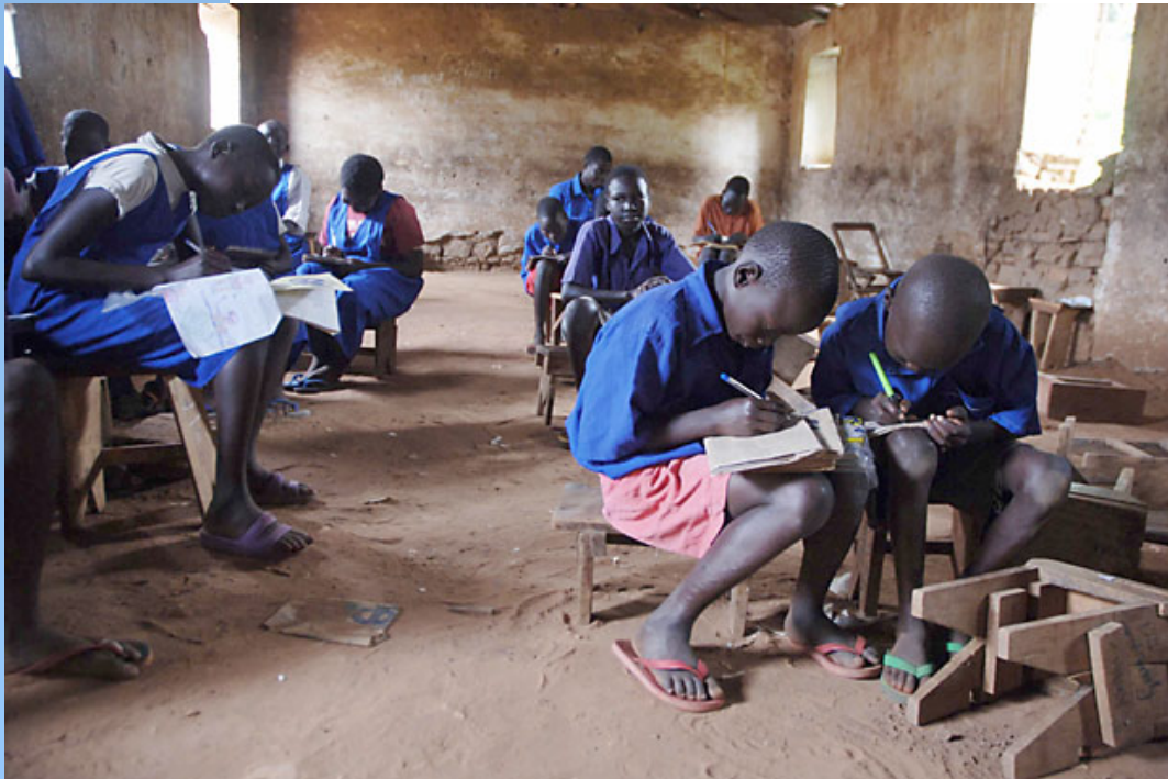
School children study English at school in Yei.