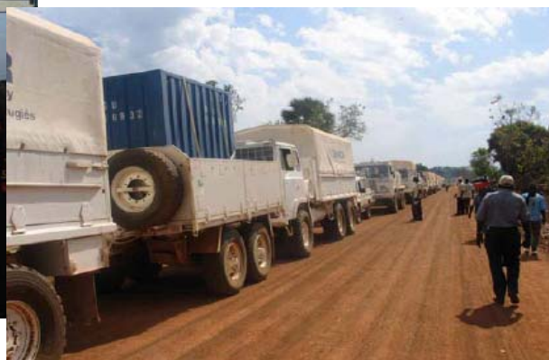
Convoy for repatriation from CAR.