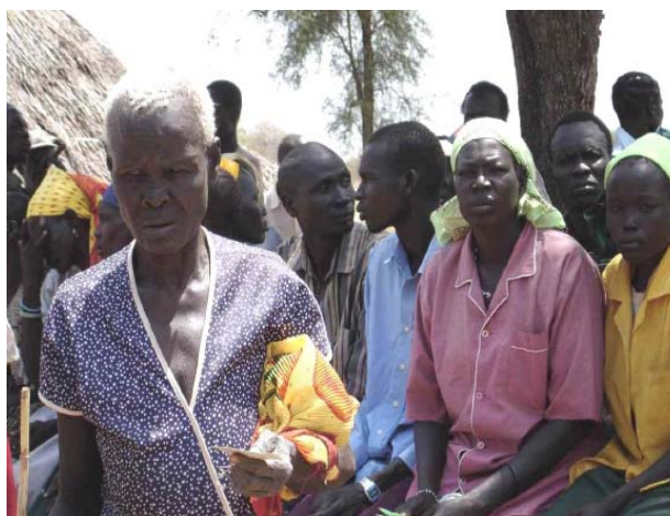
Sudanese refugees in Moyo queue to register for repatriation.

Insecurity and the lack of infrastructure have slowed down the return of development agencies and community-based organizations. Those that are present have become UNHCR's partners in building the capacities of receiving communities. UNHCR's pro-