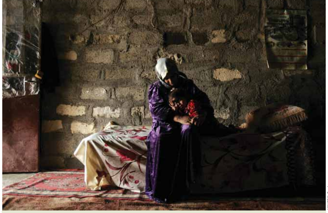
A woman fled her home town after a mortar attack killed several children.