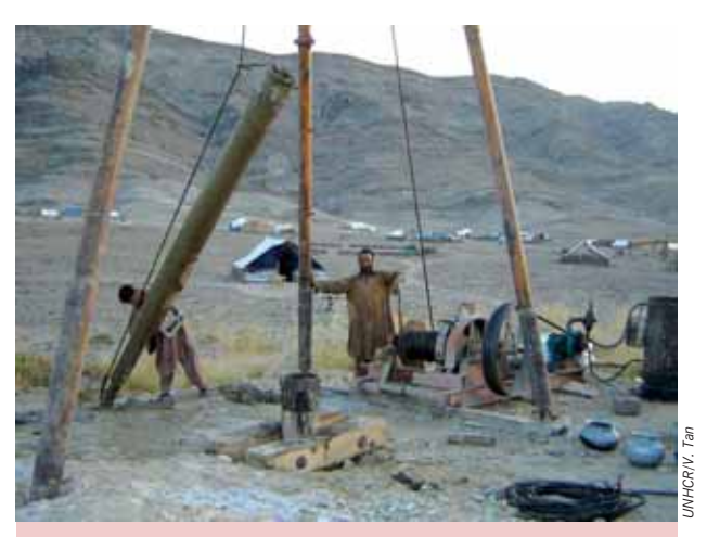
Sheikh Mesri returnees at a UNHCR-funded project in Jalalabad township.

UNHCR will support the government-led programme to allocate public land to landless returnees. An Employment Service Centre, established in partnership with the ILO at the Ministry of Refugees and Repatriation, will assist returnees in finding employment. The situation of returnees will be monitored and evaluated to assess the sustainability of return. The Office will also continue to provide legal aid.