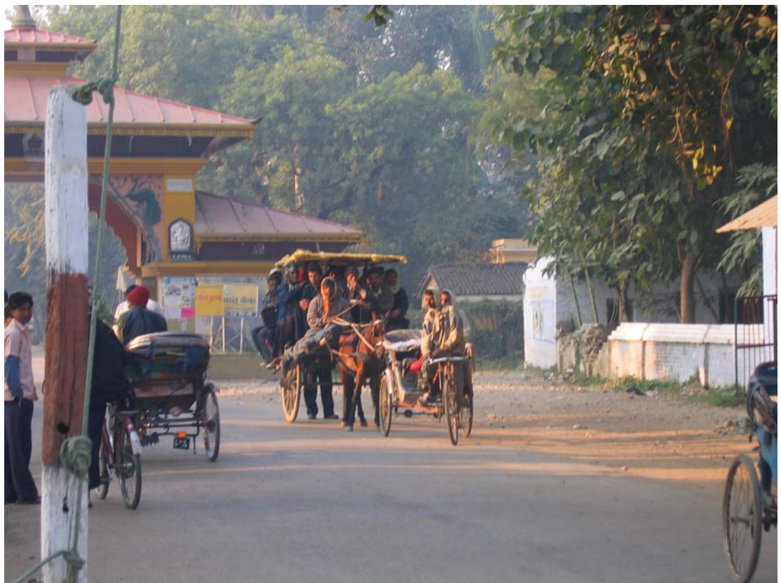
Nepalgunj border crossing point with India

20<sup>th</sup> November to 1<sup>st</sup> of December 2006