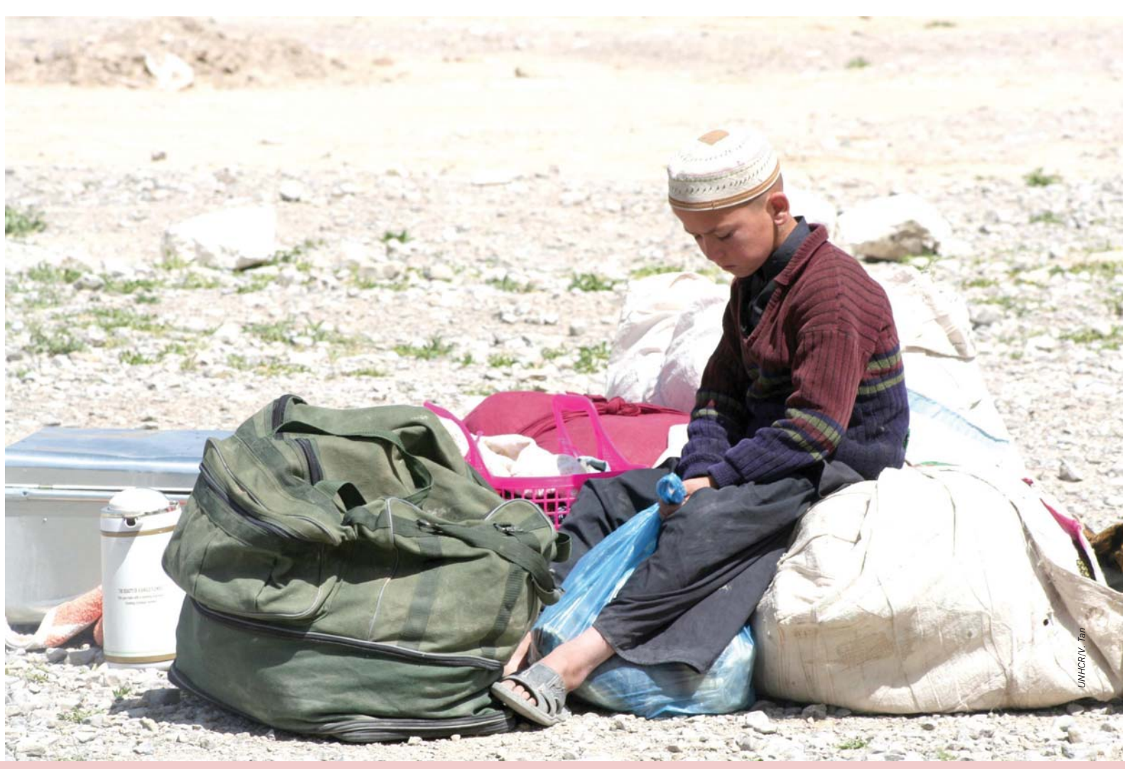
An Afghan boy with his luggage at Baleli voluntary repatriation centre in Pakistan.

Advice and Legal Aid Centres (ALAC) counselled people of concern and developed links with local authorities, host communities and humanitarian assistance providers. The centres provide accurate and timely