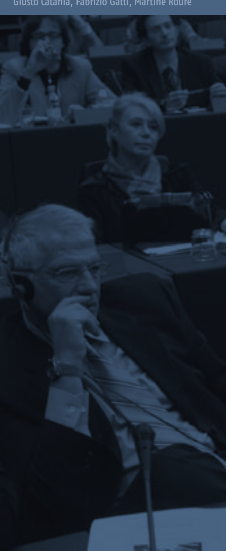
Josep Borrell, President of the European Parliament