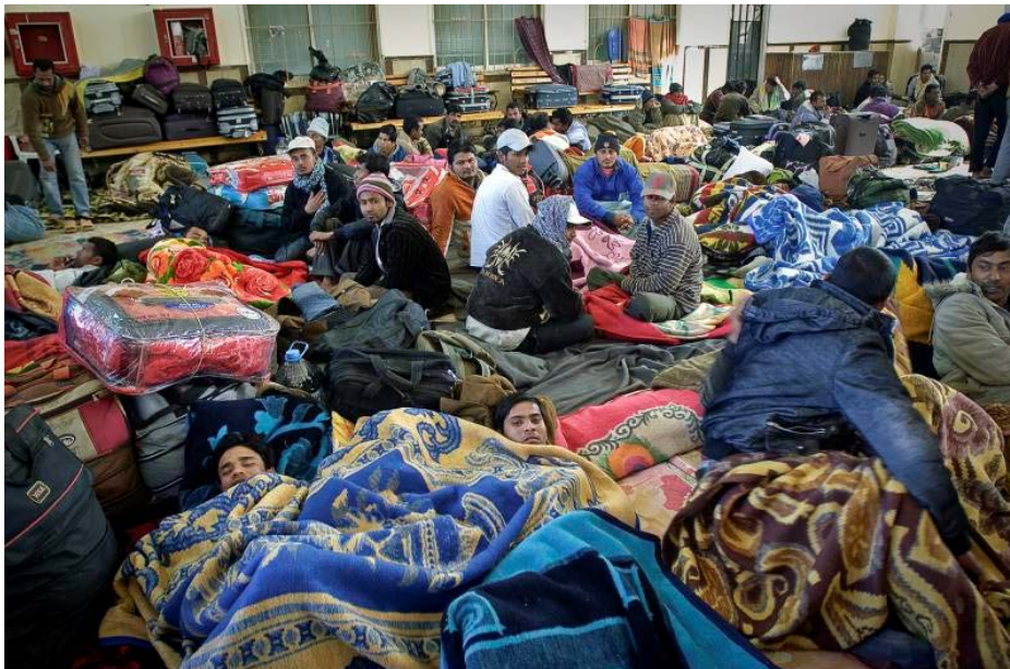
Bangladeshi migrant workers, some of them stranded for more than a week, in the arrival hall of Egypt's Sallum border post. / UNHCR / F.Noy/ March 2011

According to OCHA, the contingency planning figures in the flash appeal will be revised and a revised version of the Flash Appeal will be made available in two weeks time.