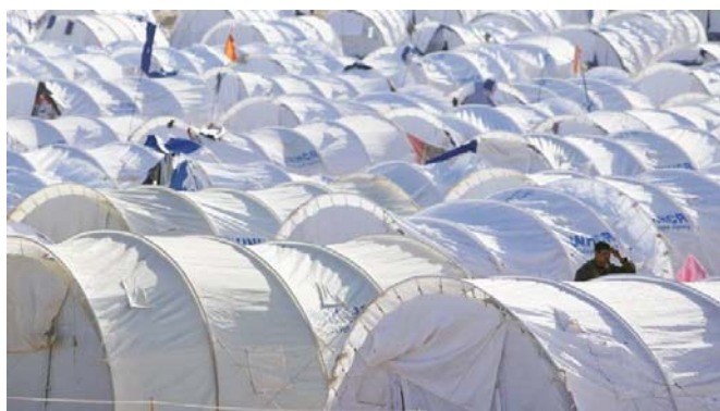
A sea of tents in the UNHCR-run Choucha camp./UNHCR March 2011