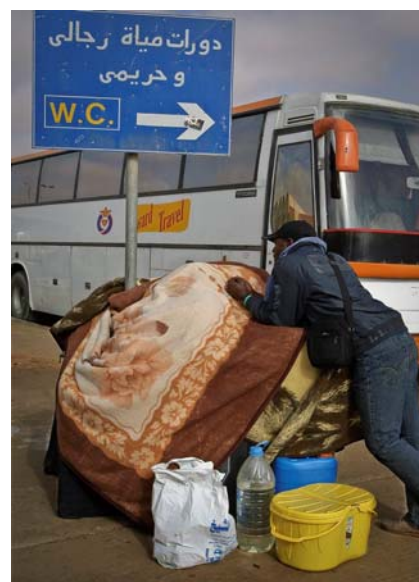
A Ghanaian man waits for a flight to take him back home./ UNHCR/ March 2011