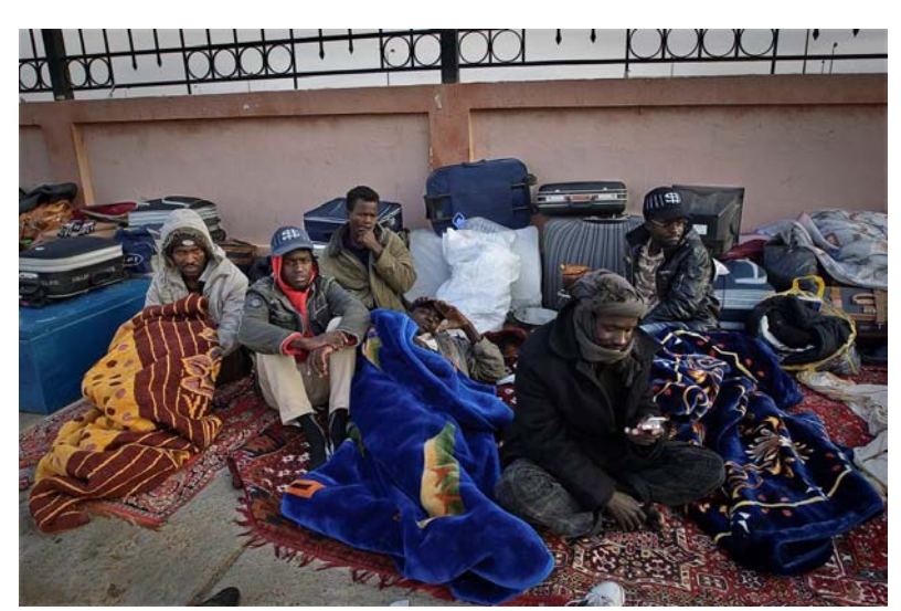
A group of Sudanese citizens on the sidewalk of the border post of Saloum.

resettlement effort include refugees recognized by UNHCR while they were in Libya as well as non-Libyan refugees recognized subsequent to their flight from Libya.