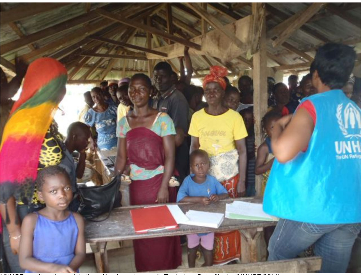
UNHCR monitors the registration of Ivorian returnees in Toulepleu, Cote d'Ivoire