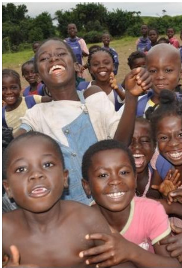
Children in Little Wlebo camp, Liberia