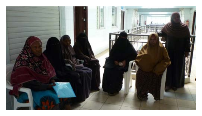
Women preparing for a group discussion about family planning in the community, July 2011.

We visited Kenya to examine the extent to which Somali