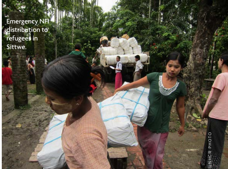
Emergency NFI distribution to refugees in Sittwe.

recognize its responsibilities towards communities affected by displacement, and lift restrictive legal and administrative practices.