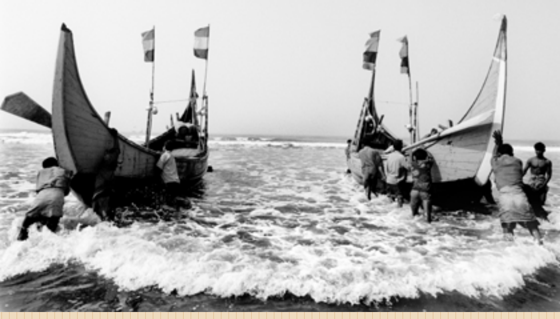
On the coast of Bangladesh, a group of refugees from northern Rakhine State in Myanmar push their fishing boats out to sea. Most stateless persons are not refugees but those who are must be treated in accordance with international refugee law.