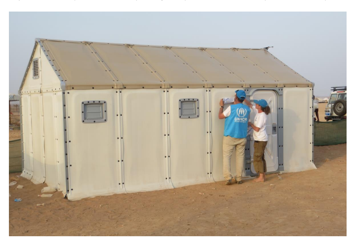
UNHCR staff put the final touches on the newly constructed Refugee Housing Unit during a training of trainers held on 2 and 3 September at Markazi Camp. Sept 2015

UNHCR is grateful for the generous contributions of donors who have given unearmarked and broadly earmarked contributions to UNHCR this year as well as the following donors who have directly contributed to the operation: USA | European Union | Japan | CERF