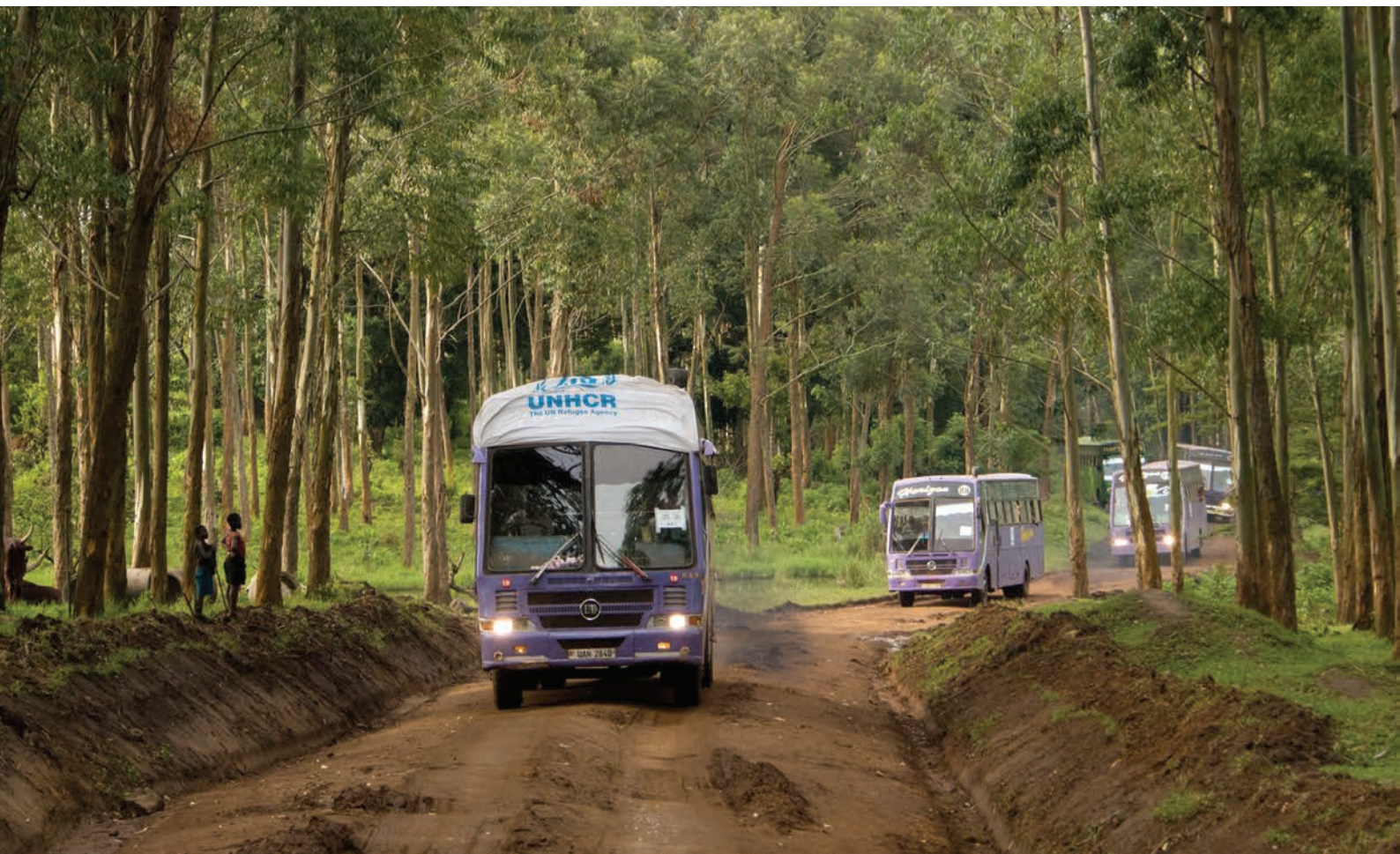
A UNHCR convoy of Congolese refugees on its way to Kyangwali settlement, Uganda.

U NHCR's Headquarters staff, located in Geneva, Budapest and other regional capitals, work to ensure that the Office carries out its mandate in an effective, coherent and transparent manner.