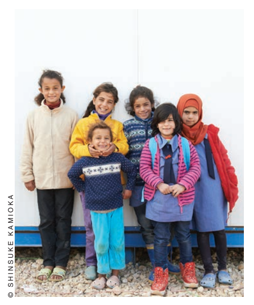
Children wearing clothes distributed by UNIQLO in Zaatari refugee camp, Jordan.

The financial contributions received from UNIQLO, in particular to support UNHCR's response to emergency situations, are another illustration of the company's sustained commitment to the Office's humanitarian work. The company also provides refugees in Japan with an opportunity to undergo vocational training at UNIQLO shops, an experience which opens the door for employment opportunities in the country. Plans to expand these vocational training activities to other refugee-hosting countries are currently under discussion.