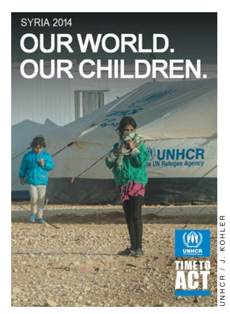
Cover of the Time To Act brochure

Appeal will assist Syrian children to go back to school, and help prevent child labour, abuse and exploitation, child recruitment into armed groups, and statelessness, while ensuring that affected Syrian children and their families have access to psychosocial support. The Time to Act Appeal has so far raised over USD 2.5 million: fundraising campaigns are ongoing in France, Monaco, Sweden and the United States, and will be rolled out elsewhere in 2015.