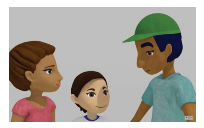
This video is available at: <a href="https://youtu.be/93OgdoQBMnE">https://youtu.be/93OgdoQBMnE</a>.

According to the standard procedure, after viewing the video, the child is asked to explain in his/her own words the video's content. The OPI then clarifies any issue to the child and provides an overview of the asylum procedure. The OPI must communicate to COMAR in written form, and no later than 72 hours, whenever a child is interested in lodging an asylum claim, or if a child is considered to be in need of international protection as a refugee. In the latter case, COMAR must contact the child to learn more about his/her position and initiate asylum procedures. The National System for Integral Family Development (DIF) is also expected to participate in these matters, accompanying the child and providing emotional support.