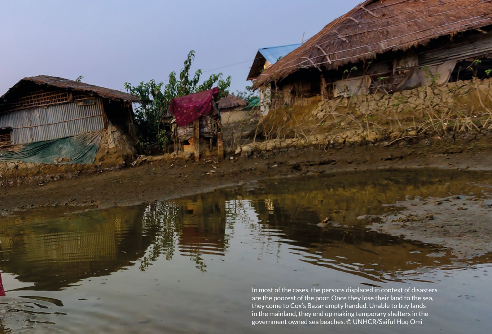
In most of the cases, the persons displaced in context of disasters are the poorest of the poor. Once they lose their land to the sea, they come to Cox's Bazar empty handed. Unable to buy lands in the mainland, they end up making temporary shelters in the government owned sea beaches.

especially in the Inter-Agency Standing Committee (IASC), the Advisory Group on Climate Change and Human Mobility, and the Global Protection Cluster. It examines the nature of 'protection', and briefly considers the 'mandate' question.