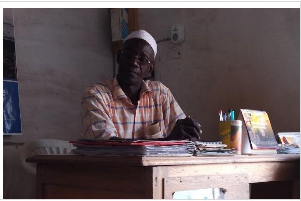
Figure 3. Meeting with the chair of a local refugee committee

These committees bring together various stakeholders and serve as a point around which community mobilisation, awareness and advocacy can take place.