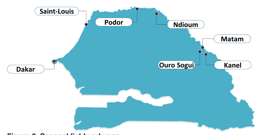
Figure 2. Senegal fieldwork map