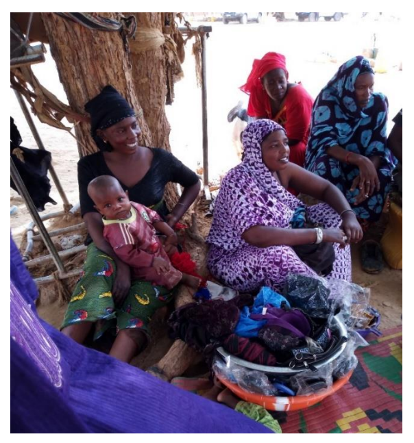
Figure 5. Women discuss how working together as a group has helped build a sense of community

realise this access as some may not be aware of their rights and not all financial service