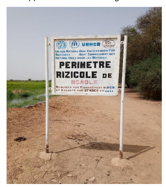
Figure 4. Group of farmers producing rice since receiving support from UNCHR in 2011

42. This same evaluation recommended that UNHCR support to refugees "should be for a period of one to two years maximum, so as to consolidate the gains and prospects for sustainability, with the emphasis on (a) Strengthening the capacities of groups; (b) Repair of defective equipment; (c) Establishment of capacity for the maintenance and repair of all equipment."38 Following on from these recommendations, in 2018, for example, UNHCR worked with seven mixed groups to ensure access to land for rice production as well as helping with the formal registration and recognition of these as formal economic groups or GIEs.<sup>39</sup> In addition to partnering with OFADEC, UNHCR has worked with SAED, which has provided technical support in the area of irrigation and farming.