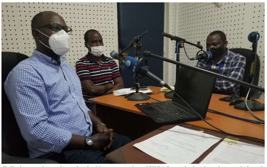
Talk show in the studios of radio Nyagatare where YWCA Rwanda developed, recorded, and broadcast mini radio drama sketches on PSEA for residents of the Nyabiheke refugee camp.

YWCA Rwanda developed, recorded and broadcast mini radio drama sketches on PSEA, which were broadcast to 14,000 residents of the Nyabiheke refugee camp and 300,000 persons from the surrounding districts of Nyagatare, Gatsibo and Gicumbi. Live radio talk shows were conducted to engage the target audience for feedback on attitudes, behavior changes, raising awareness on SEA. Nearly 600 people participated in the talk shows through phone calls and social media. YWCA also conducted a three-day training on PSEA and gender-based violence for staff and street theatre writers and performers, and also developed, produced and disseminated nearly 4,000 IEC materials in the form of brochures to host communities.