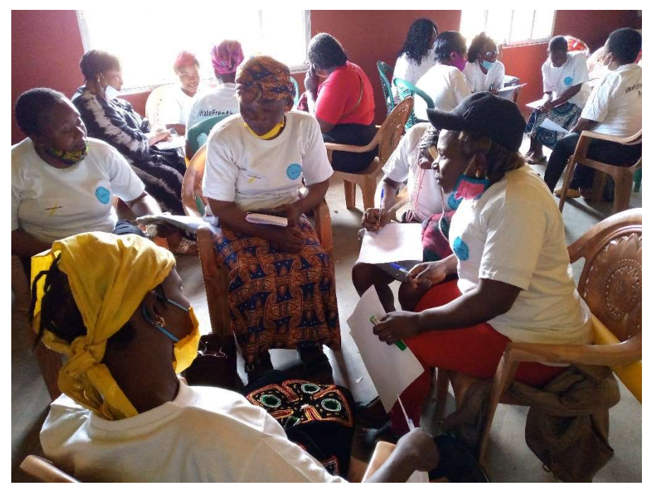
Women with disabilities in Cameroon are consulted on PSEA communication challenges.

SOPISDEW engaged with the Cameroon Community Media Network (CCMN) of organizations (which includes 57 radio stations, 13 TV stations, 29 newspapers and magazines, and 10 online news outlets) to expand awareness on PSEA and reporting channels in six regions in the North-West and South-West of Cameroon . Six CCMN members representing community media were trained on PSEA. SOPISDEW engaged 12 media organizations to produce community awareness-raising radio dramas and TV spots in pidgin, English, and French. In addition, a print article was produced, along with posters, fliers and products in Braille. With support of the CCMN, these activities reached more than 500,000 persons.