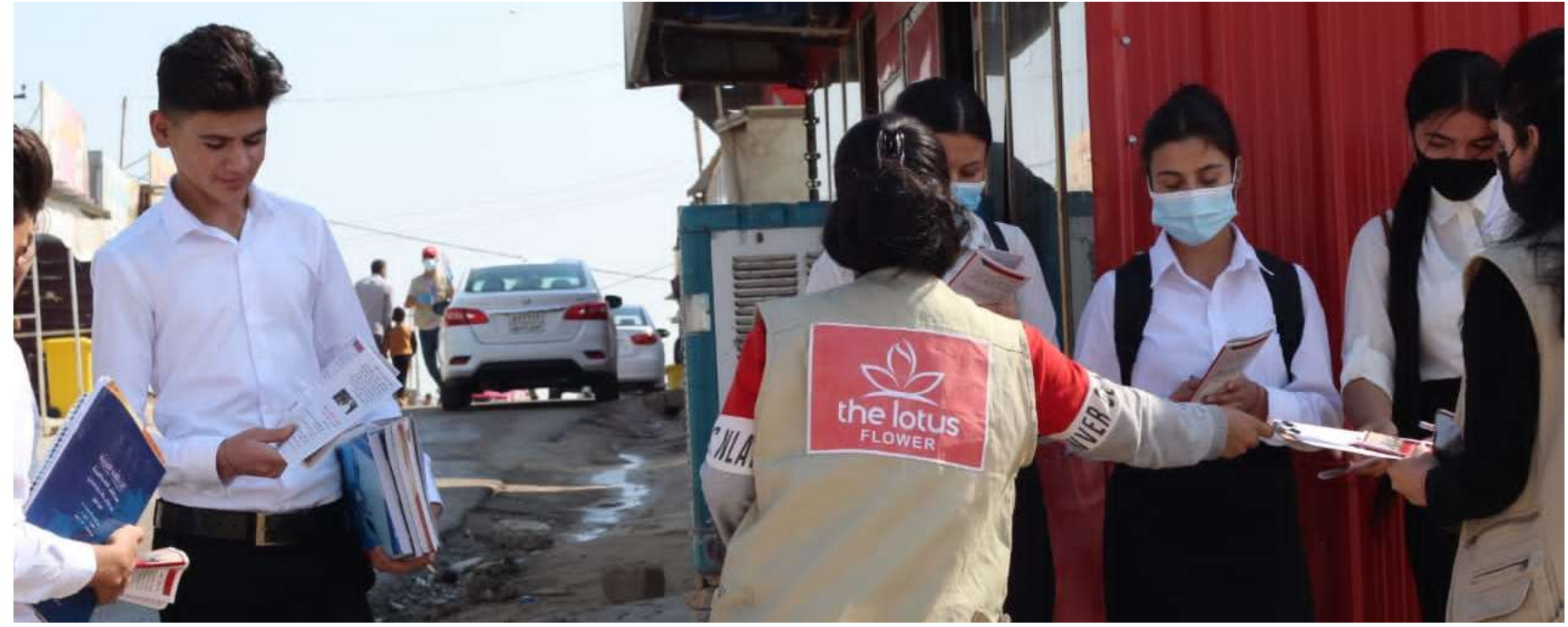
Community outreach and information with young people in Iraq on how to safely report SEA allegations.

The launch of the Fund was met with immense interest by local PSEA stakeholders in 2020, with more than 1,600 applications received to date from NGOs worldwide. All eligible applications were reviewed and scored by an interagency steering group of PSEA experts, drawn from IOM, UNICEF, Oxfam, Translators Without Borders and the Communicating with Disaster Affected Communities Network, as well as ICVA and UNHCR. In September 2020, the first round of awards was made to 19 NGOs to help them reinforce PSEA through strengthened community awareness and engagement. Many of the selected projects, featured below, aim to strengthen engagement with key groups such as adolescent girls, language minorities, persons with disabilities, persons of diverse sexual orientation and gender identity (SOGI), people in geographically isolated areas and communities where risks of transactional sex are known to be high. Several also emphasize measures to address new risks of SEA arising from the COVID-19 pandemic.