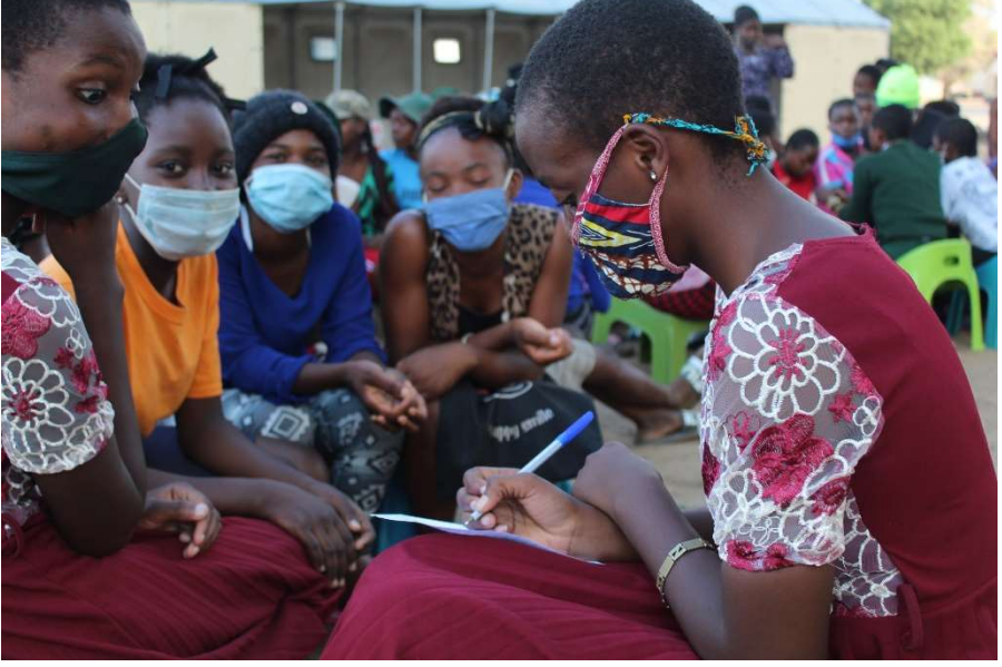
Childline holds a group session on PSEA for young people in Zimbabwe.