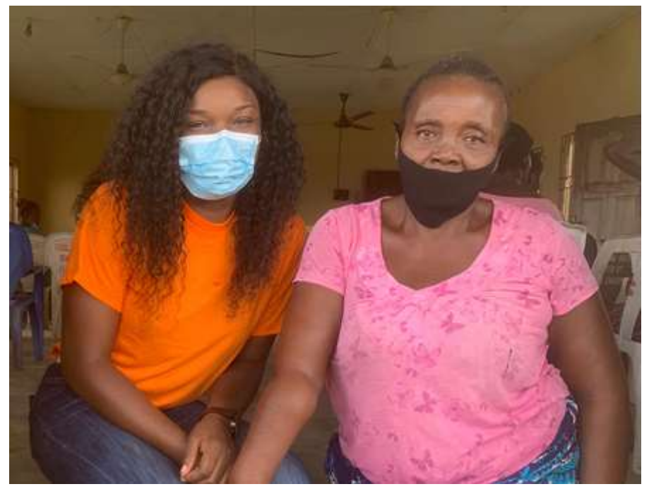
Consulting women with disabilities in Nigeria to ensure that PSEA systems are inclusive and accessible.

GRID worked with internally displaced persons (IDPs) in the Patani community to raise awareness on existing Community-Based Complaints Mechanisms (CBCMs), whilst strengthening safe and confidential entry points to disclose SEA and request assistance, including through health and social welfare centres. Over the course of four weeks, the organization developed and broadcast awareness-raising videos and songs, and held call-in radio programs on what constitutes SEA. GRID also produced and distributed 2,000 copies of the Violence Against Persons Prohibition (VAPP) Act in pidgin and other local languages, as well as an audio version for the blind.