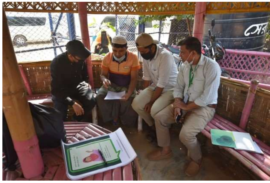
Pre-testing draft PSEA awareness-raising materials with community members.

BCCP designed multi-media materials to increase community awareness on core SEA concepts and risks, promote the use of the SEA reporting system, and sustain community mobilization on the issue in the long term. Targeting women, men, children and persons with disabilities within the Rohingya community, BCCP developed video clips, pictorial cards, posters, leaflets, directional signboards on referrals, flip charts, a facilitator's guide and a billboard promoting an emergency number for PSEA. Developed in English, Bengali and Burmese language, these materials reached a total of 11,000 of beneficiaries, including 4,500 were men and 6,500 women.