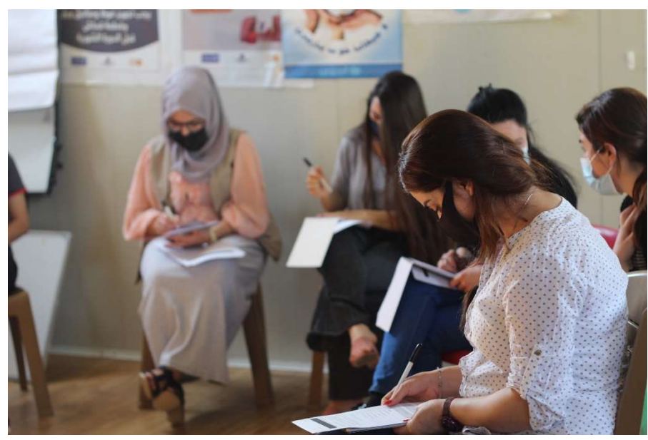
PSEA awareness raising in Iraq.

Lotus Flower organized evaluation and consultation assessments in the Domiz, Essyan and Rwanga IDP camps, during which 63 community members had the opportunity to express ideas and share their awareness of SEA. This enabled the organization to plan projects and activities which would meet the requirements and needs of each community. Lotus Flower also established a PSEA Training of Trainers to 40 of its own staff and other NGOs, including volunteers and trainers in Duhok, Essyan and Rwanga camps. A dedicated hotline for SEA reporting and complaints was created, and complaint boxes were placed at the organization's three centres in the camps. Community Attanweer Development Foundation, Yemen mobilisation and awareness sessions and focus group discussions were convened with more than 1,000 community members, of which 70 per cent were women and girls.