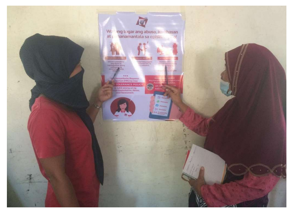
Community members in the Philippines read the guidelines on SEA reporting.

HRC focused on producing awareness-raising materials, which included video and radio messages, a brochure, tarpaulins, posters and a manual on PSEA. The women-led Technical Working Group governing the project organized focus group discussions with communities in Mindanao to gather feedback and ensure the IEC materials were appropriate to the context and the audience.