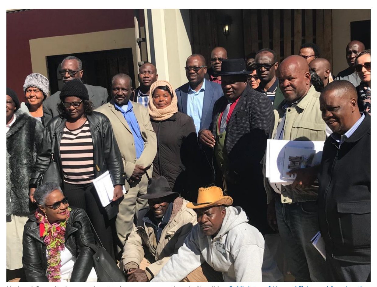
National Consultations on the statelessness conventions in Namibia.