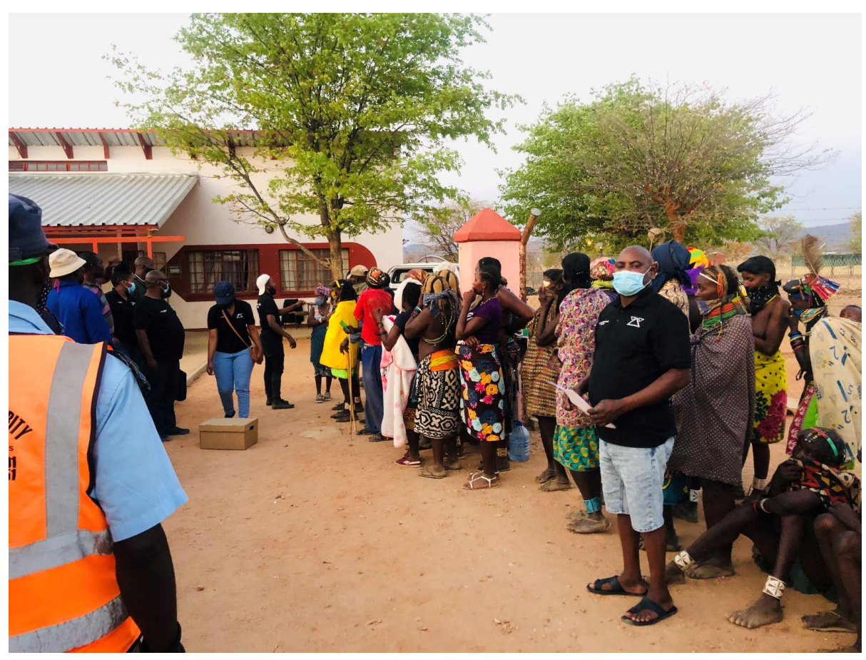
Data collection in Namibia