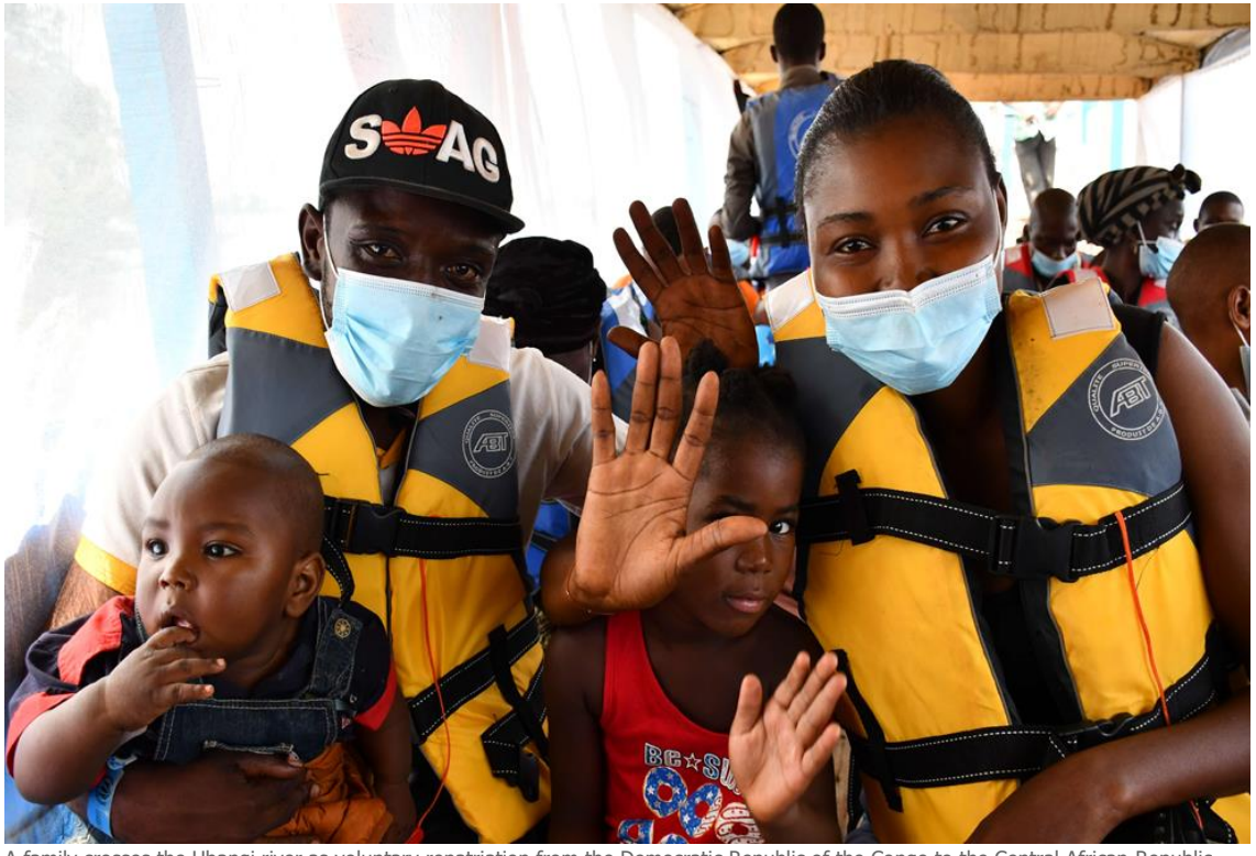
A family crosses the Ubangi river as voluntary repatriation from the Democratic Republic of the Congo to the Central African Republic resumes following COVID-19 delays.