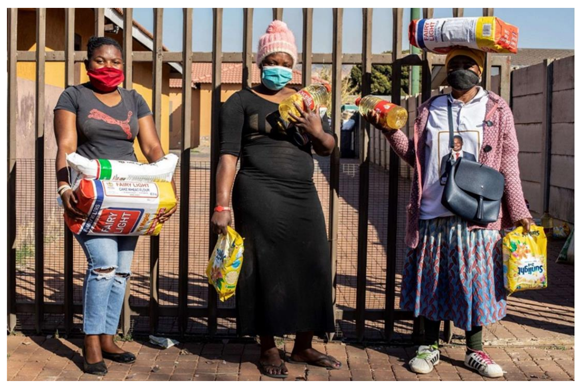
Local women assisted by the Somali business community in Pretoria, South Africa. Refugees helped host communities during COVID-19 by distributing aid to local families in need.