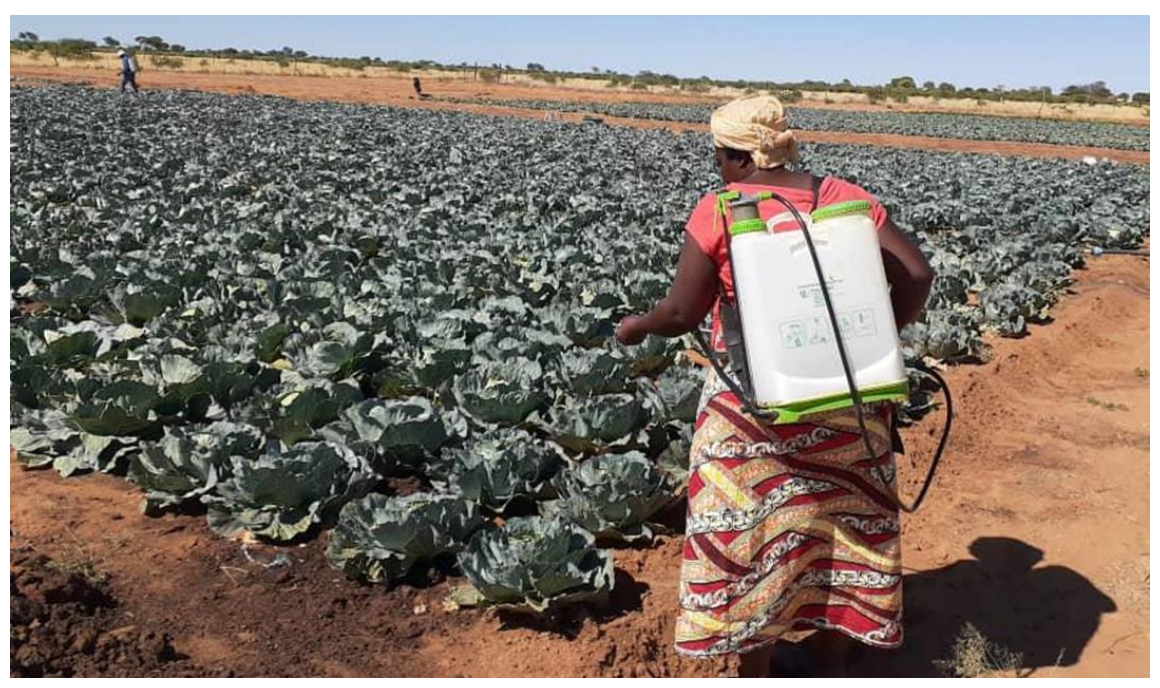
Horticulture production in Osire settlement, Namibia.