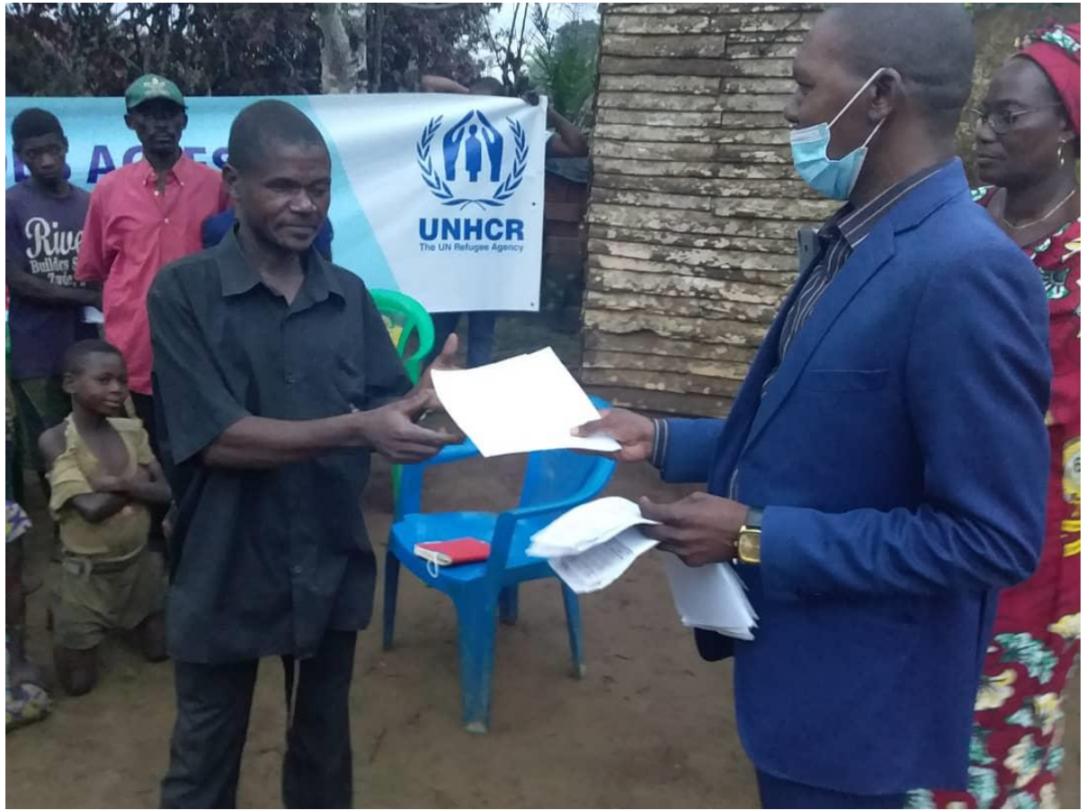
Ceremony for the delivery of birth certificates to indigenous populations in the Lekoumou Department