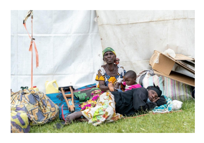
DRC situation (31%)