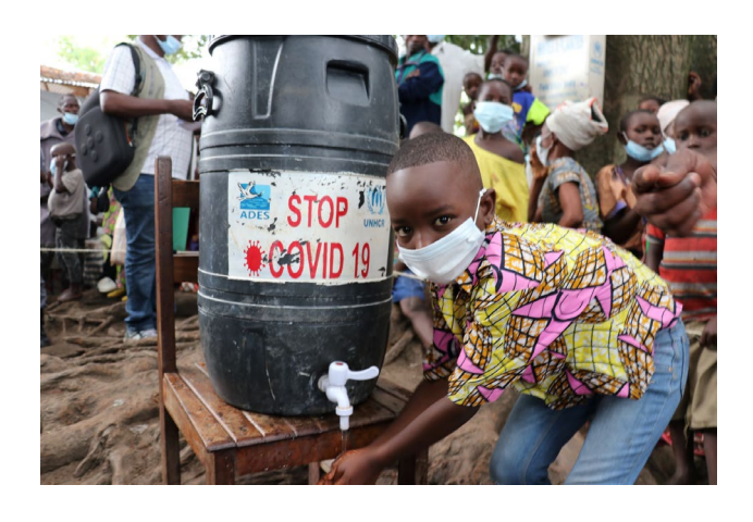
COVID19 situation (27%)