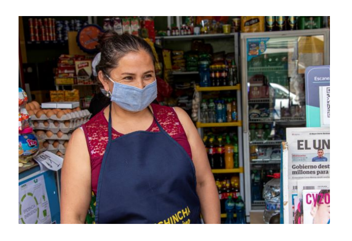
Venezuela situation (31%)