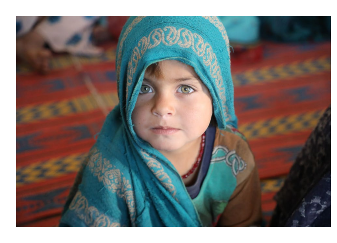
Afghanistan situation (27%)