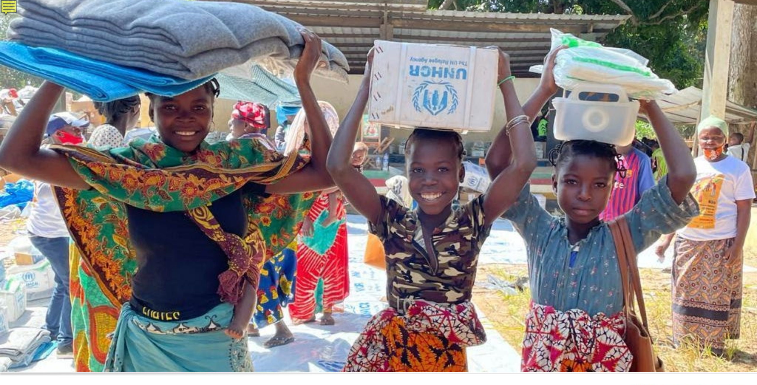
Flexible funding report: Mozambique