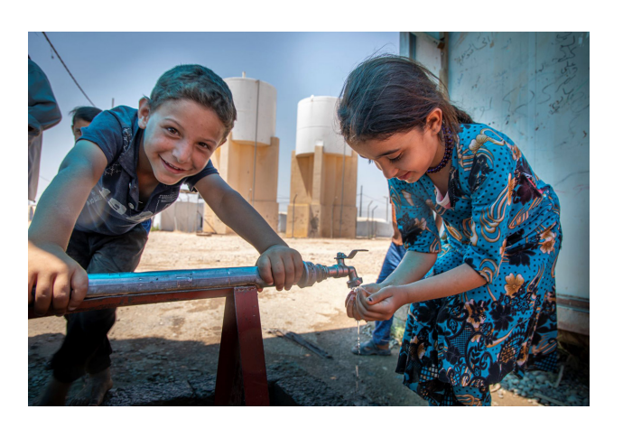
Iraq situation (19%)