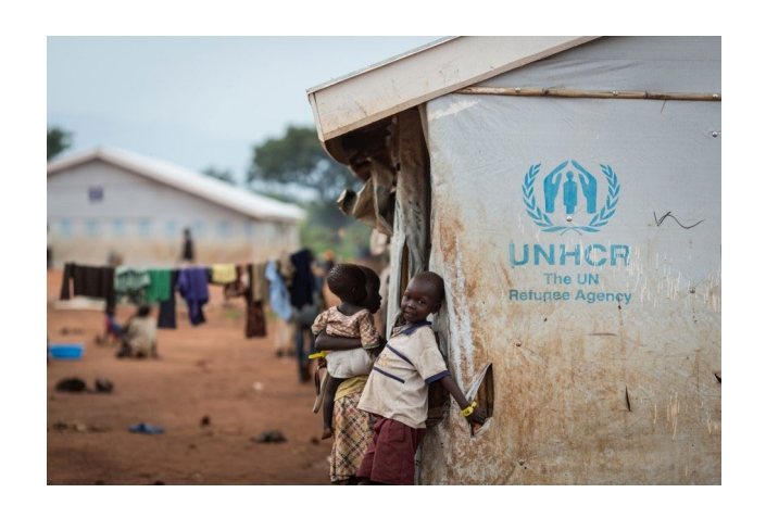
South Sudan situation (23%)