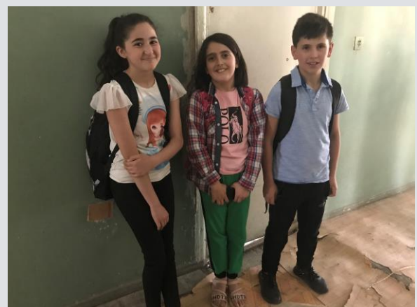
Schoolchildren from displaced families during the NK conflict, Abovyan, Kotayk Province, June 2021.

Two municipalities and five community-based organizations were provided with technical assistance in Syunik province. Construction of two sports courts with children's playgrounds was launched in Sisian and Goris towns respectively