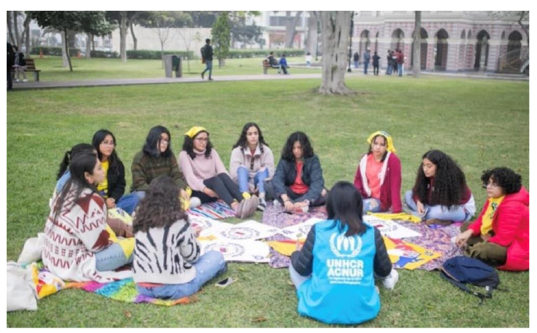
Young Venezuelan and Peruvian girls take part in a workshop run by Quinta Ola.