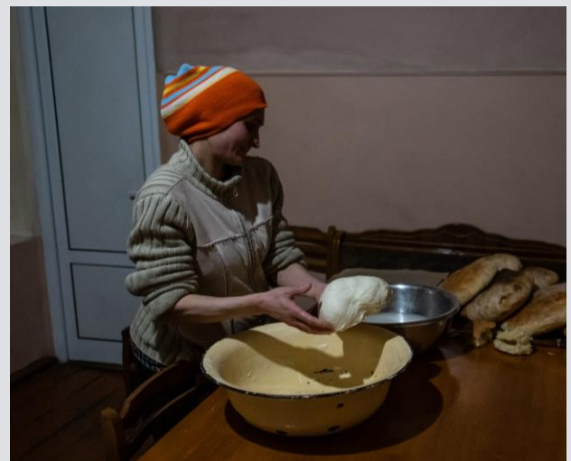
A displaced woman bakes bread for her large, multi-generational family in Getahovit village near Ijevan, Tavush Province, Armenia, February 2022.

Prevention: UNHCR and partners disseminate WHO information leaflets and posters on COVID-19 prevention and distribute face masks and other personal protective equipment to municipalities and collective shelters.