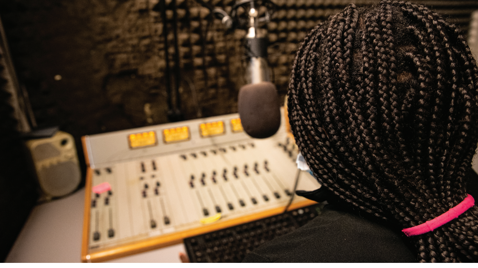
A participant of the project "The world at home" realised by Associazione Multietnica Antirazzista Donne (AMAD) in Ancona, Marche, Italy, October 2020.