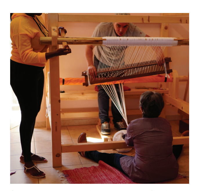
Sewing workshop realised by the association "Pro Loco Passarelli Rinaldo Sisto" within the project "Diramare -Ama-la" in Camini, Calabria, October 2020.