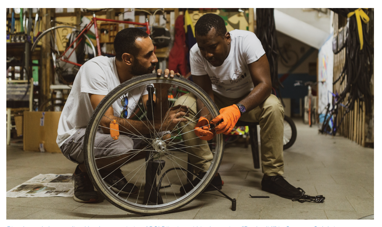
Bicycle workshop realised by the association ARCI Djiguiya within the project "Benkadi II" in Crotone, Calabria, November 2019.

At the beginning of each year, INTERSOS consults organizations on their training needs.