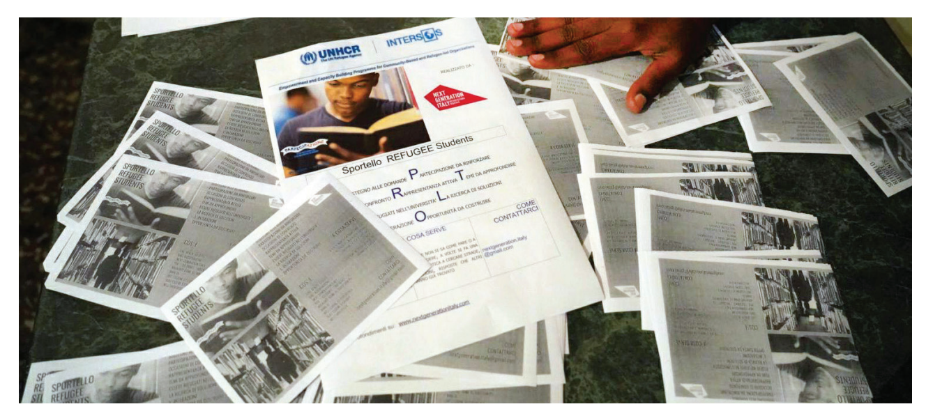
Visibility materials provided during the informative sessions realised by the association Next Generation Italia within the project "Information point for refugee students" in Bologna, Emilia-Romagna, November 2019.

Staffing involves personnel at UNHCR Italy and INTERSOS. At UNHCR, one staff member dedicates 50-60 per cent of their time to the programme. A multifunctional team manages the partnership, with a protection focal point collaborating with colleagues from communication and programming. Other UNHCR colleagues are engaged to deliver training modules, and other activities as needed.