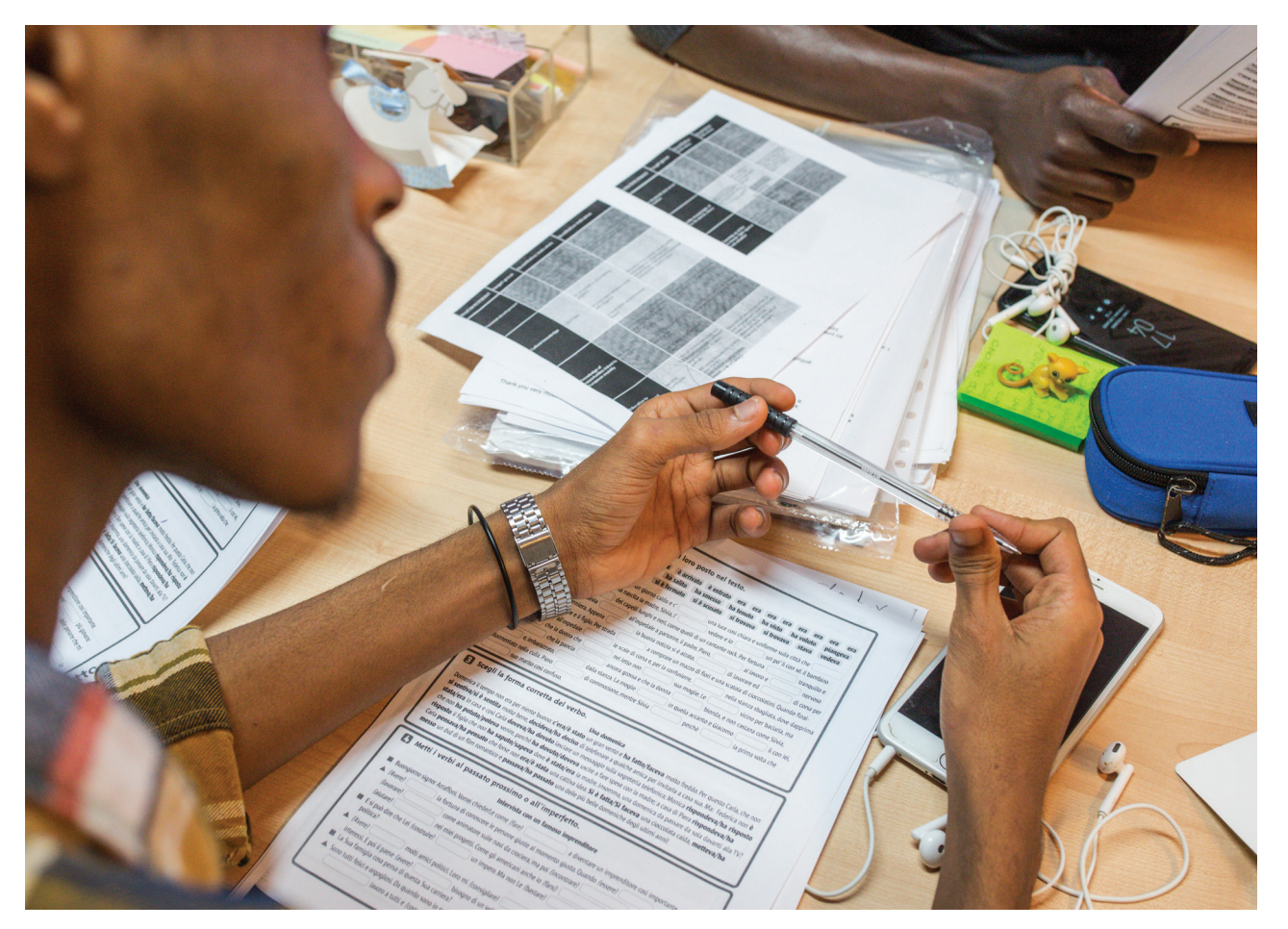
Bicycle workshop realised by the association ARCI Djiguiya within the project "Benkadi II" in Crotone, Calabria, November 2019.