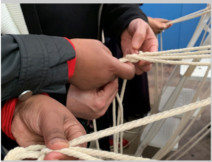
During the 16 Days of Activism against gender-based violence, UNHCR Portugal held a GBV workshop raising awareness on GBV and holding participatory discussions on challenges in this area through artistic expression.