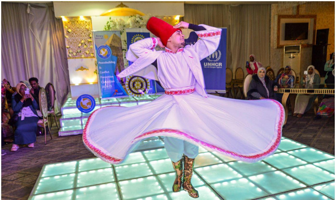
On 19 March, UNHCR organized a Ramadan iftar in Alexandria, bringing together 160 participants, including 90 refugees. Sudanese, Syrian, and Egyptian artists performed, enriching the evening with diverse cultural expressions. The event aimed to provide refugees forced to spend Ramadan away from home with a sense of community and belonging.

On 13 March, UNHCR and partners conducted a legal clinic in Cairo, allowing 58 refugees and asylum-seekers to receive direct legal support.