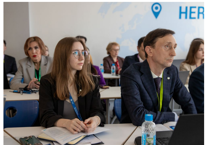
Participants of "Blischenko Readings" Congress at RUDN University attending a UNHCR-led roundtable