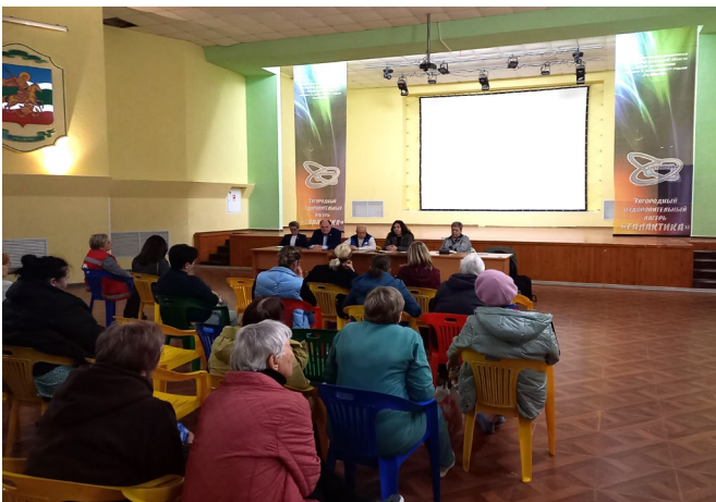
UNHCR meeting with refugees from Ukraine in a Temporary Accommodation Point in Kaluga region

* funding allocated from unearmarked contributions