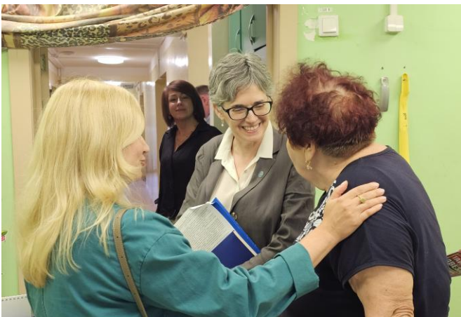
UNHCR meeting with refugees from Ukraine in a Temporary Accommodation Point in Ryazan

* funding allocated from unearmarked contributions