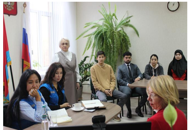
UNHCR meeting with foreign students from Afghanistan, Palestine, Haiti, Syria, India, and the DRC at Oryol State University