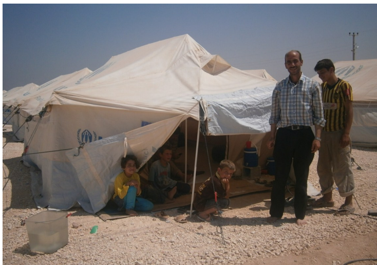
Syrian family at their tent in Akcakale camp, Saniurfa.