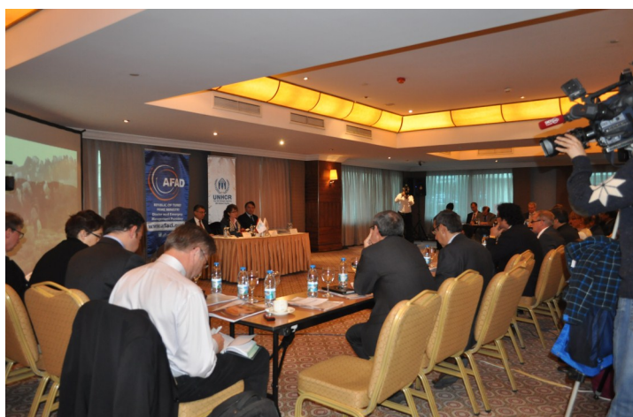
RRP Launch event in Ankara.