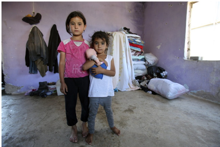
2 daughters of a Syrian refugee family with 6 members living in an abandoned house in urban settings in Turkey.