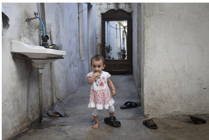
2 year old daughter of a Syrian family who has 4 children. Family is living in urban area in Turkey.