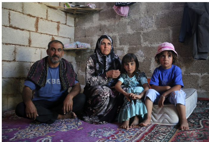
Syrian refugee family with 5 children living in urban area .

The project will address the psychological conditions of children whose families were forced to flee to Turkey due to the civil war in Syria. It aims to help such children to cope with the psychological impact of the events they witnessed, and it will also contribute to the education of Syrian children whose education was interrupted due to forced refuge. To assist with hygiene and health problems encountered by Syrian children caused by living with large families in crowded tight spaces under unfavourable circumstances, in cooperation with Ministry of Health, hygiene packages will be provided to the families. The project will also contribute to solving the nutrition problems of Syrian children by providing food packets and will develop artistic skills and competence in children to attract them to get involved in fields such as music, theatre, etc. and to support those with special talents.