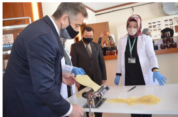
The launch event of the innovative and entrepreneurial project for refugee and Turkish women in collaboration with Gaziosmanpaşa municipality and WALD Academy.

Izmir Metropolitan Municipality developed a Guide for Municipal Staff on Refugees and a Multi-Lingual City Guide for Refugees and Foreigners through its cooperation with UNHCR in 2020. UNHCR is currently reviewing the documents and their translations into five languages. The Guide for Municipal Staff on Refugees aims to increase the awareness of municipal staff regarding International and Temporary Protection legislation and available services and referral mechanisms for International and Temporary Protection holders and applicants. The Multi-Lingual City Guide for Refugees and Foreigners includes information on city and municipal services, with feedback from refugee communities, and will be a living document to be published online and regularly updated. Printed materials will also be distributed to district municipalities and other relevant institutions to serve as a tool to advocate for inclusive service provision for refugees.