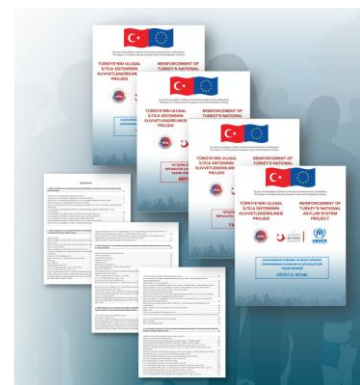
Modules and training guides for the orientation of refugee women and children and the transition of UASC within Turkish society.

Programme modules in the form of guides and training-of-trainer manuals were developed and printed to be distributed to PDMMs and relevant institutions. Several documents were also produced for women