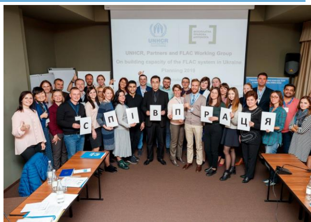
On 12 October, UNHCR met with partners (NRC, R2P, the Tenth of April, NEEKA) and Free Legal Aid Centers (FLAC) representatives from Kyiv and other regional offices. The participants discussed lessons learned from cooperation in 2018 and jointly worked on a plan for capacity building of FLAC and improving legal assistance in 2019. The highlight of the meeting was the signing of a Memorandum of Understanding between UNHCR and the FLAC system.

* Including indicative allocation of softly earmarked and unearmarked contributions.