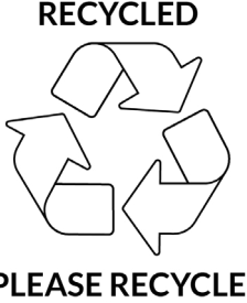
Graphic 1: Recycled Paper Symbol

Every box made of recycled paper must have a symbol about its recycled nature and the possibility to be recycled (see Graphic 1):