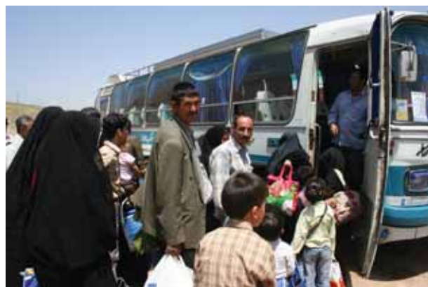
Voluntary repatriation of Afghan families ready to board a bus provided by UNHCR, on the outskirts of Tehran.

The commitment by the Iranian authorities to grant work and residency visas for one to two members of repatriated families has yet to be fully implemented.