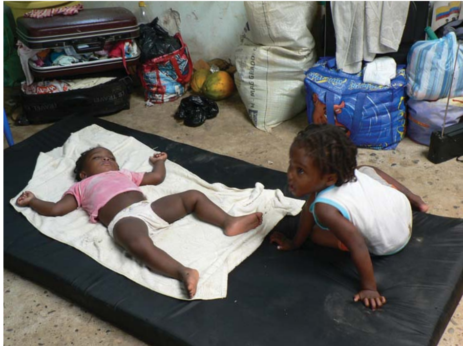
Internally displaced children in El Charco, Nariño, Colombia.

Food: In Ecuador, UNHCR distributed some 57,500 food rations, as well as fresh food for some refugees at the northern border.