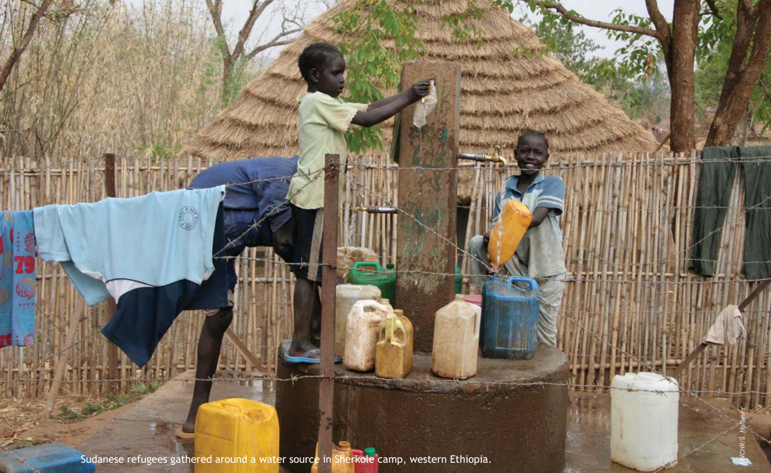
Sudanese refugees gathered around a water source in Sherkole camp, western Ethiopia.