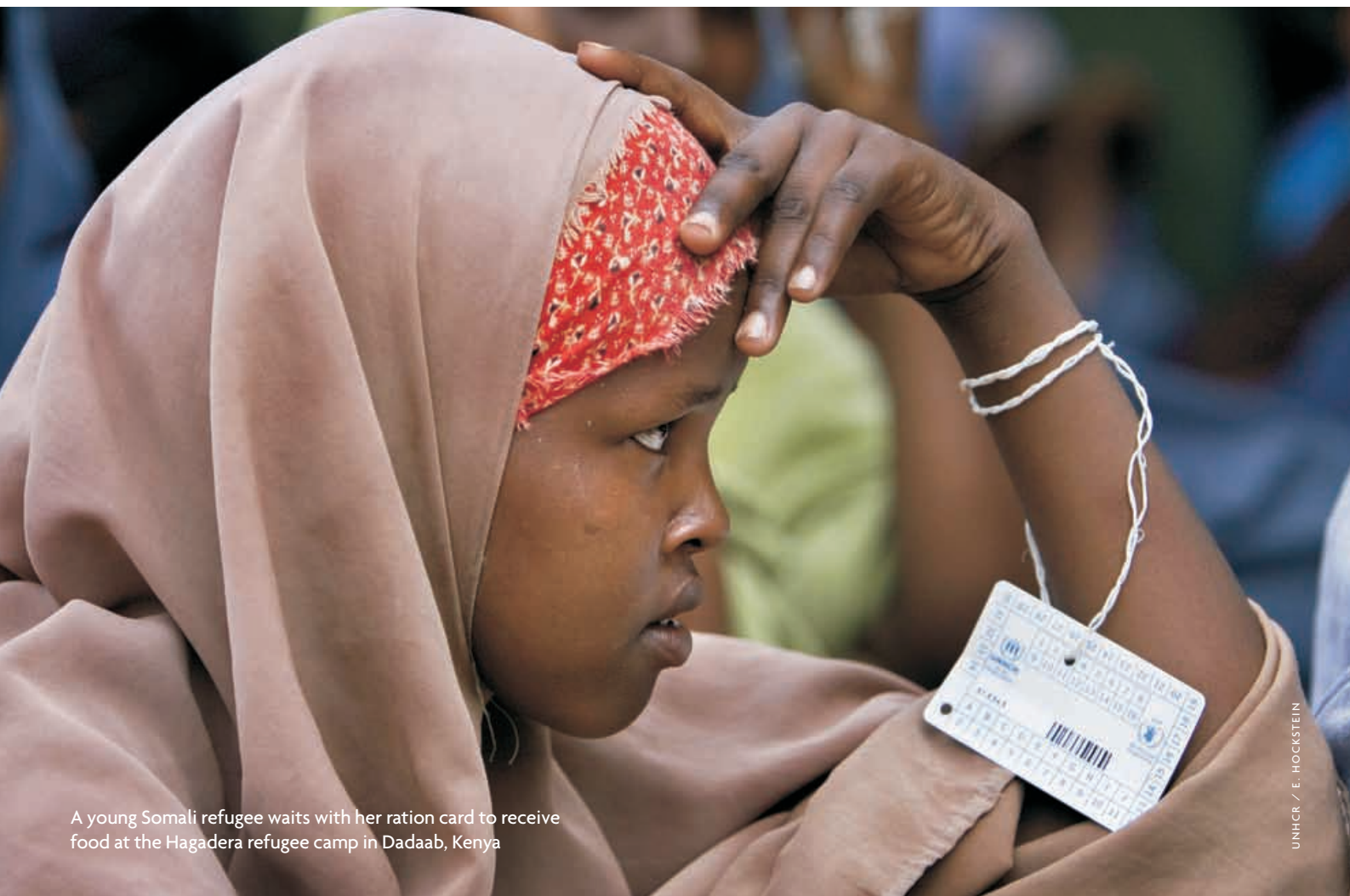
A young Somali refugee waits with her ration card to receive food at the Hagadera refugee camp in Dadaab, Kenya

Water: The average distance between tap stands and dwelling places is 300 metres. The per capita water supply for the refugees dropped from 17.8 litres per person per day in January 2008 to 15.8 litres per person per day in December 2008 largely due to the increase in population. The number of taps increased from 843 in 2006 to 875 in 2008. Additional boreholes are to be drilled to increase the potable water supply and to provide some for animal husbandry.