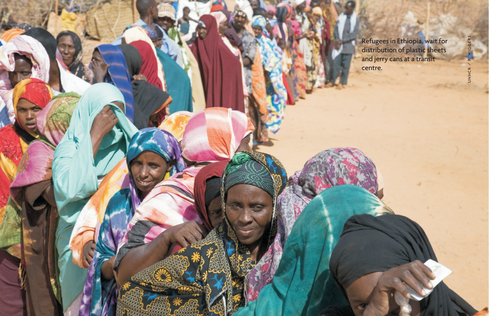
Refugees in Ethiopia, wait for distribution of plastic sheets and jerry cans at a transit centre.